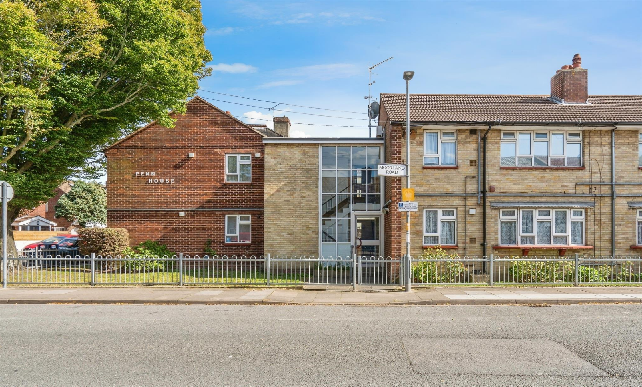
Penn House St Marys Road, Portsmouth PO1 5PW