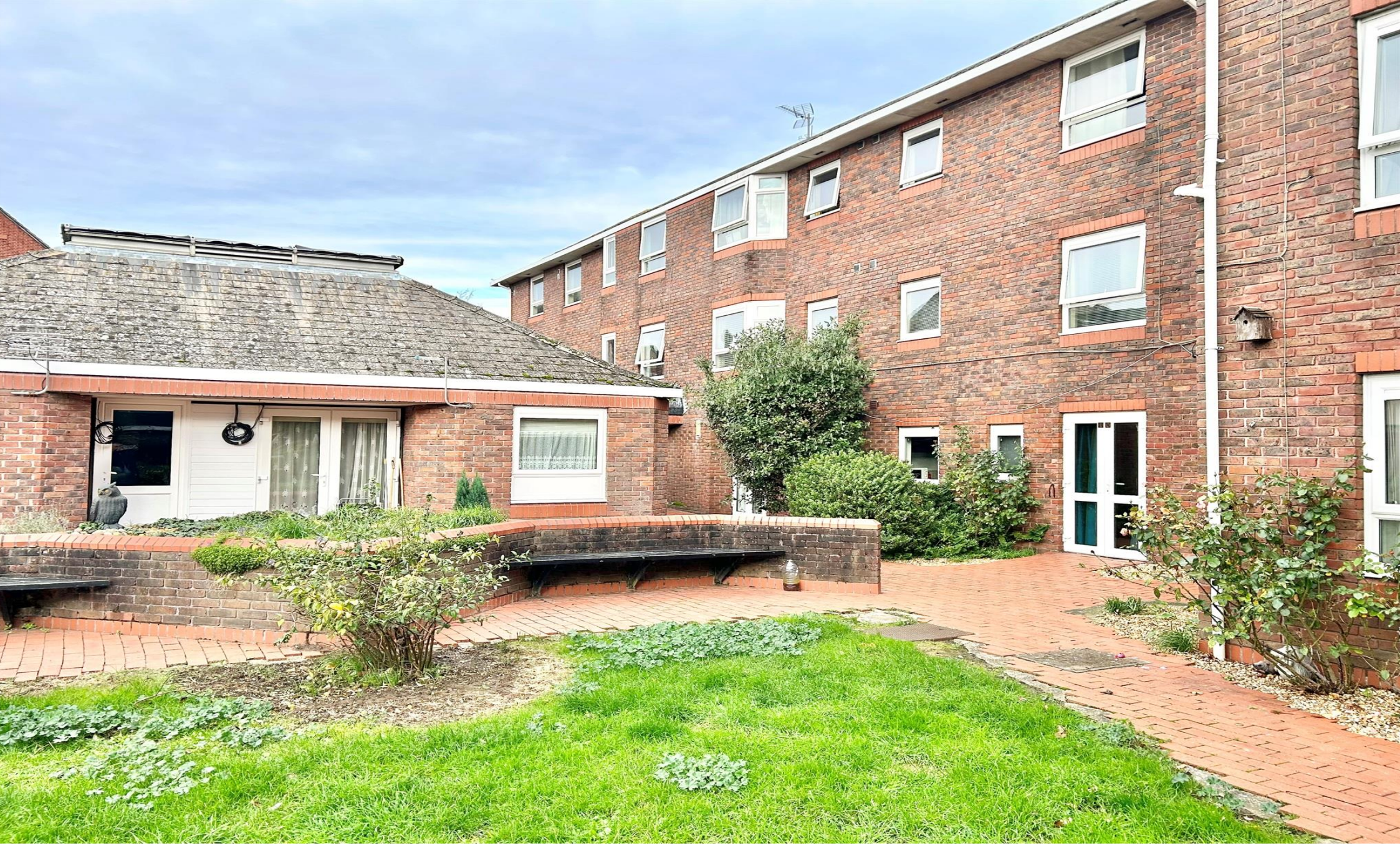
The Willows Twyford Avenue, Portsmouth PO2 8NU