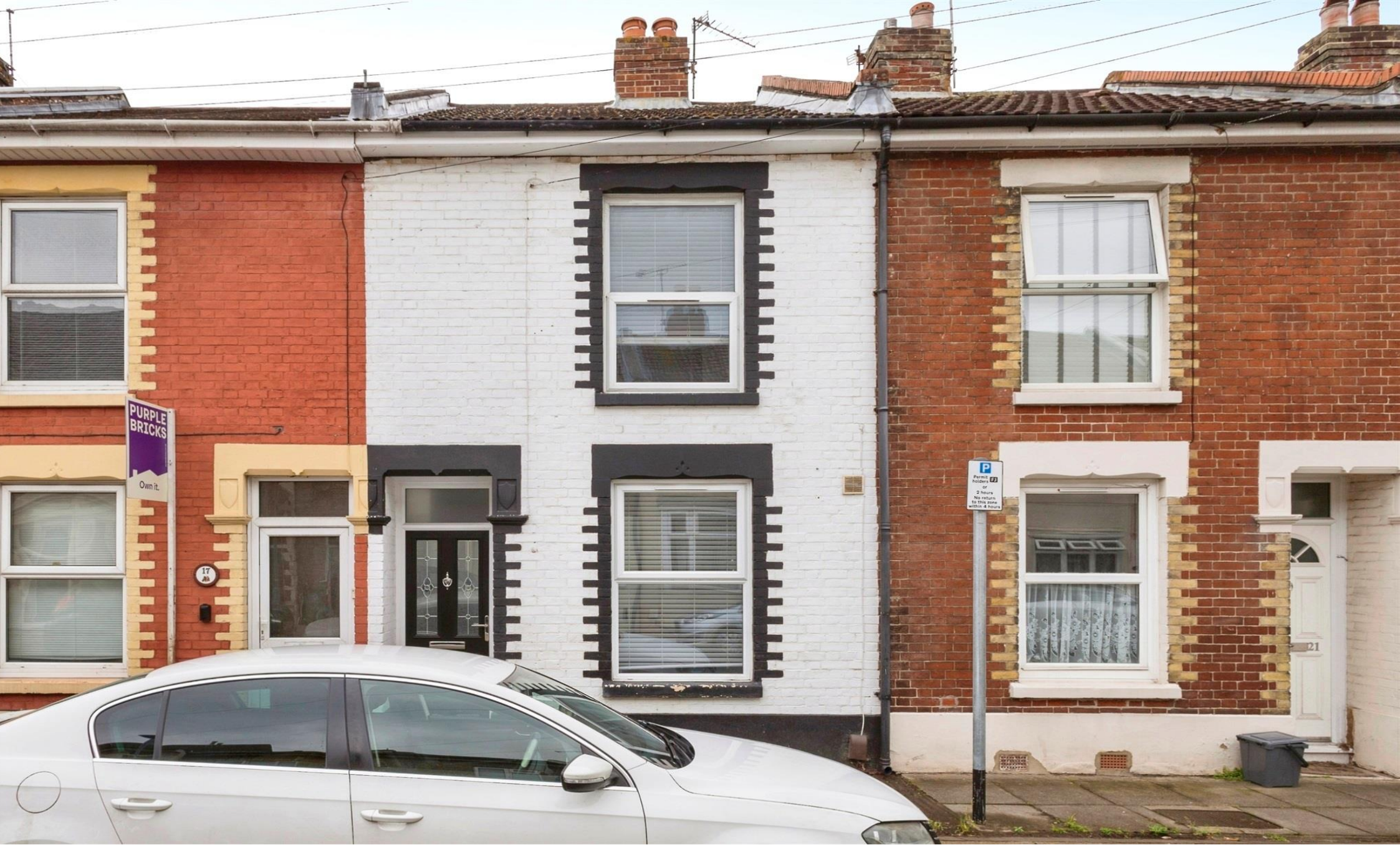
Gruneisen Road, Portsmouth PO2 8QD