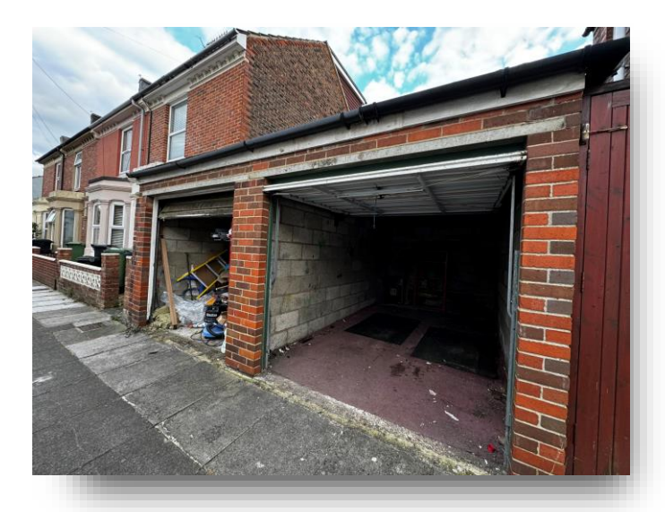
Garage Left Hand Side 15' 2" x 7' 8" ( 4.62m x 2.34m )

Garage Right Hand Side 15' 3" x 8' (4.65m x 2.44m)