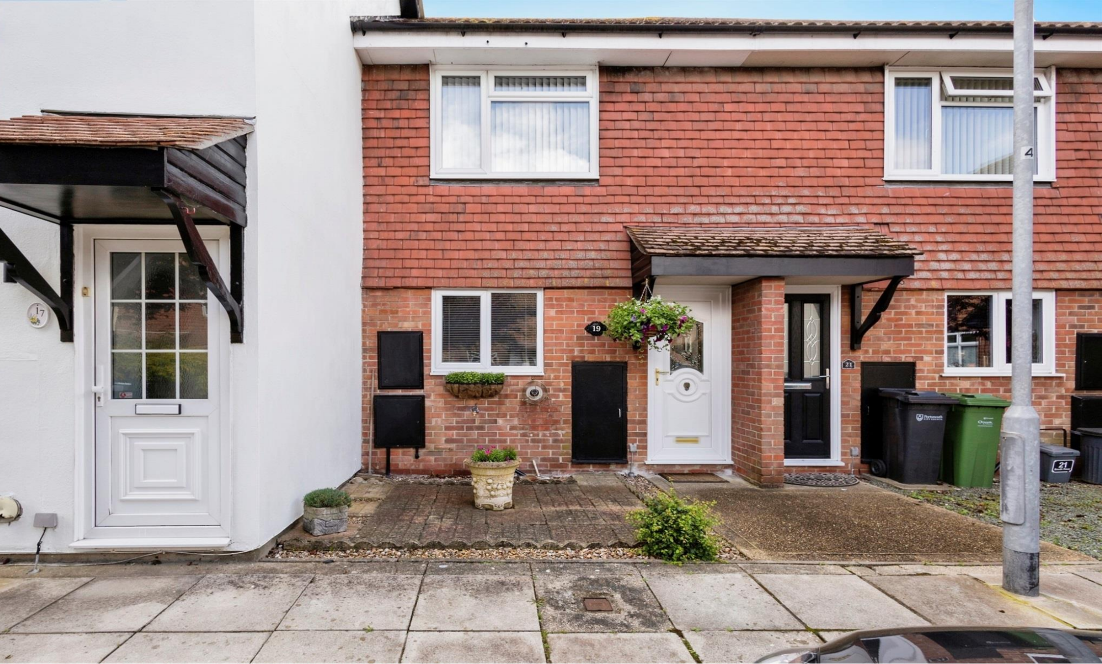
South Road, Portsmouth PO1 5QT