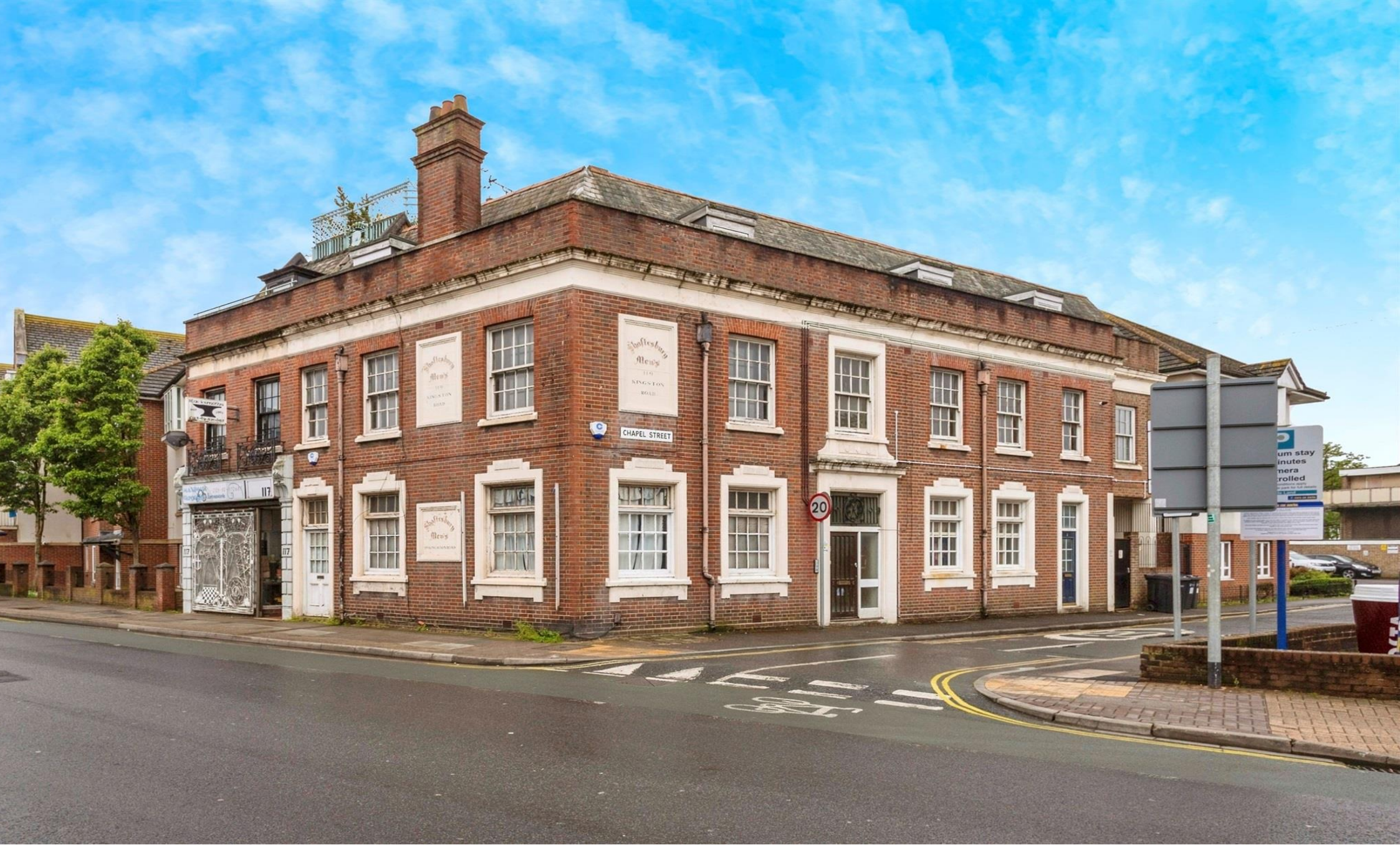
Chapel Street, Portsmouth PO2 7DJ