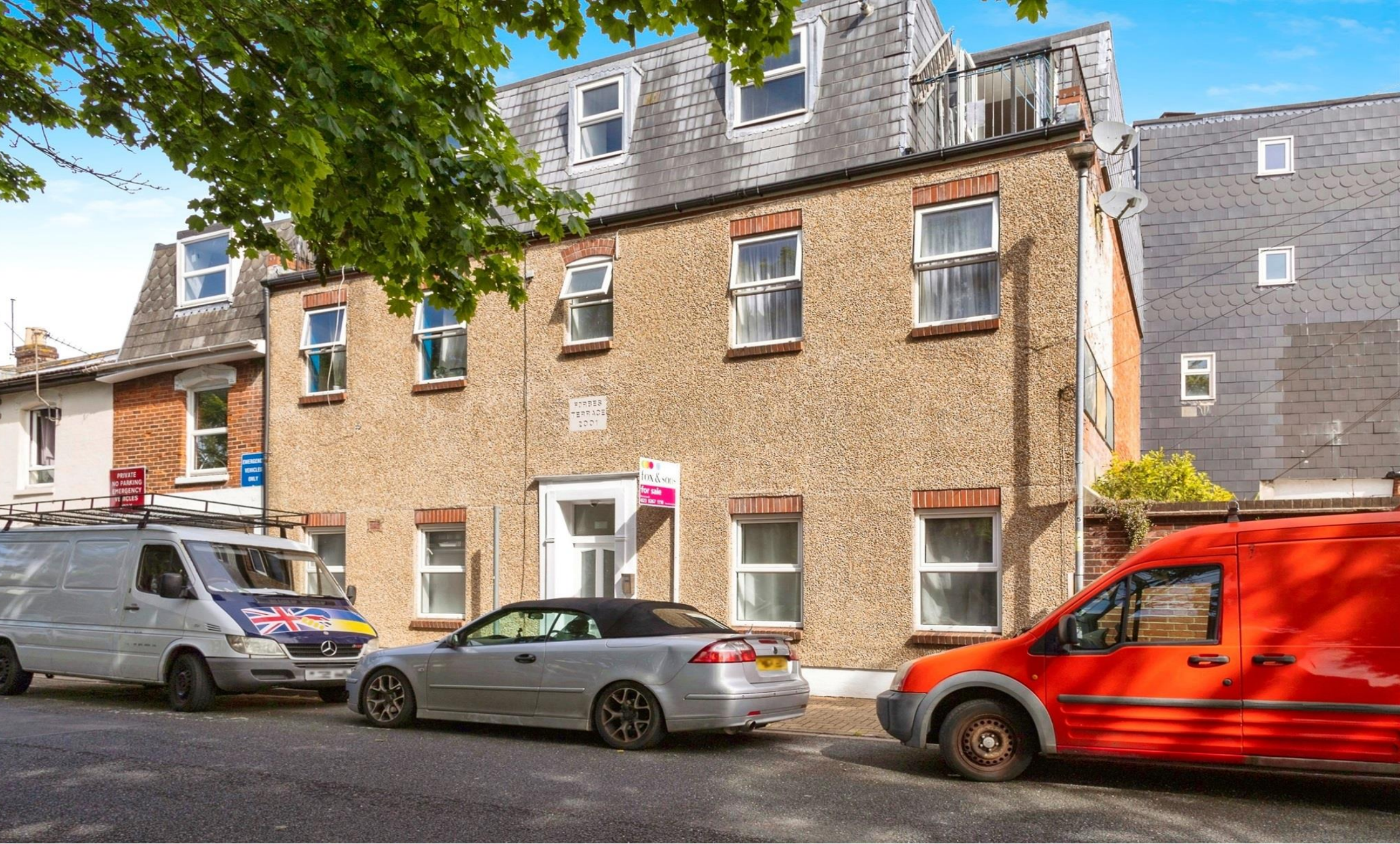
Pearl Villas Washington Road, Portsmouth PO2 7DU