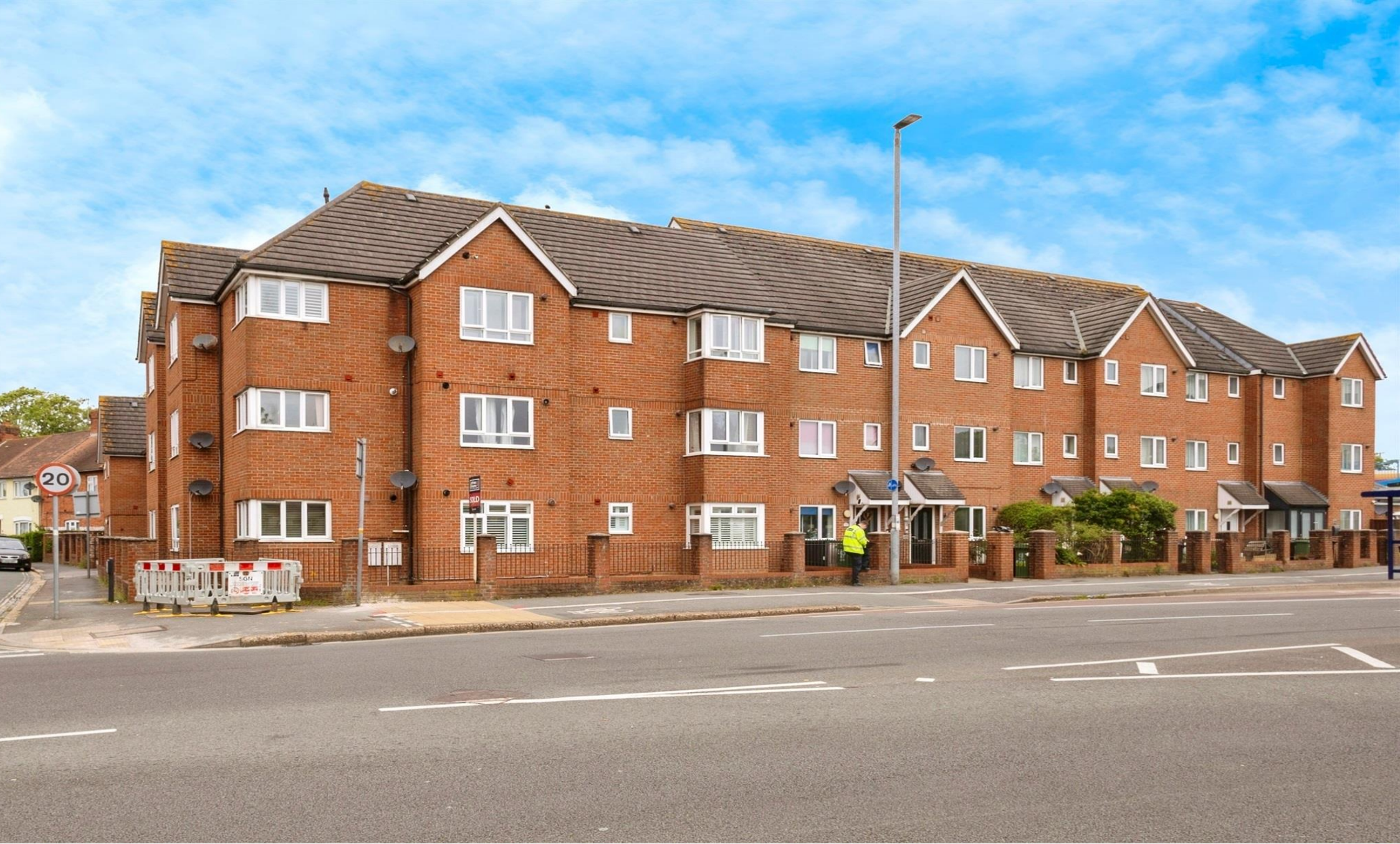
Hilsea Heights Hilsea Crescent, Portsmouth PO2 9SW