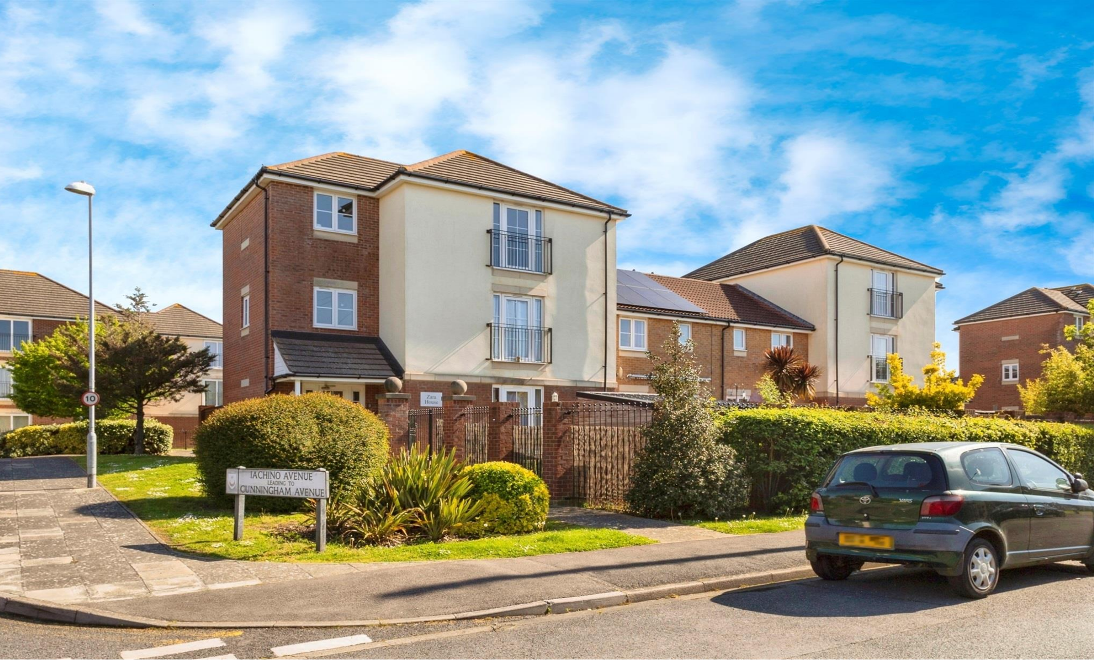
Zara House Matapan Road, Portsmouth PO2 9AF