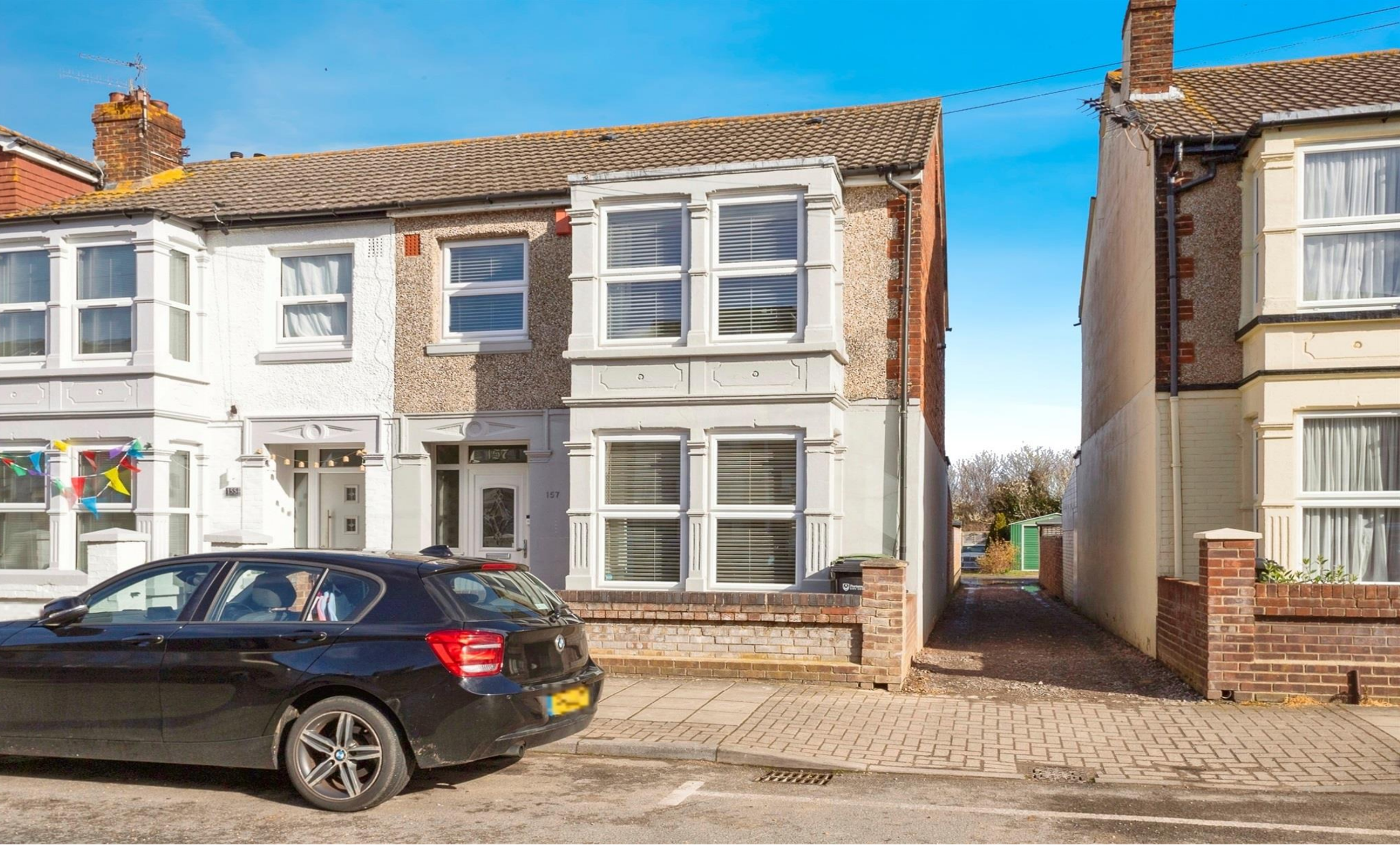
Hayling Avenue, Portsmouth PO3 6DY