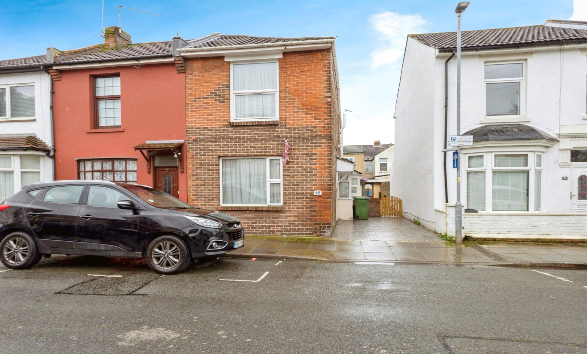
Knox Road, Portsmouth PO2 8JJ