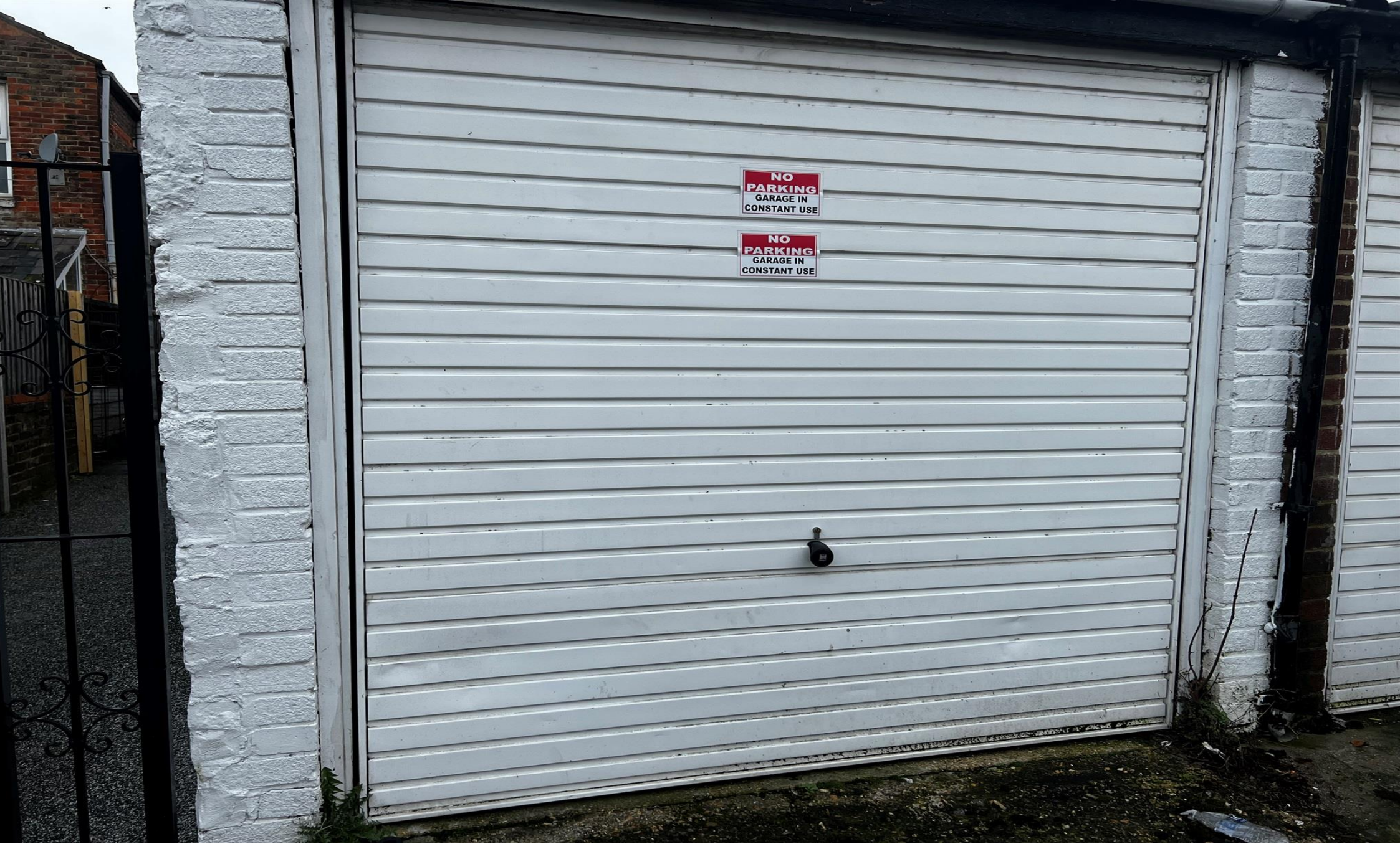
Garage 3 Station Road, Portsmouth PO3 5BQ