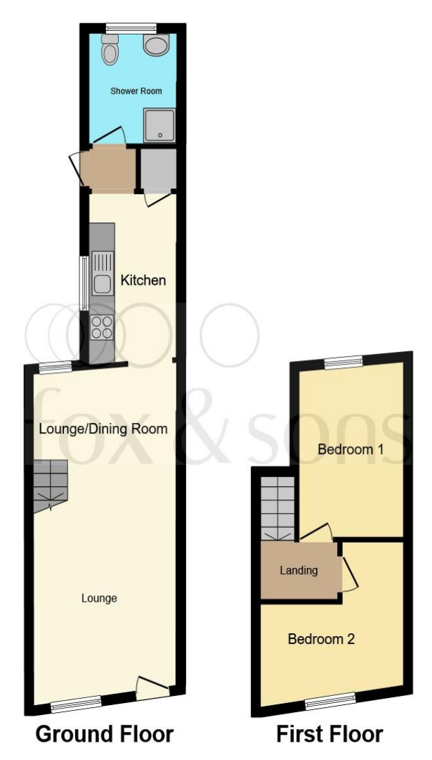
Total floor area 60.2 sq.m. (648 sq.ft.) approx

This floorplan is for illustrative purposes only and is not drawn to scale. Measurements, floor-areas, openings and orientations are approximate. They should not be relied upon for any purpose and do not form any part of an agreement. No liability is taken for any error or mis-statement. All parties must rely on their own inspections.