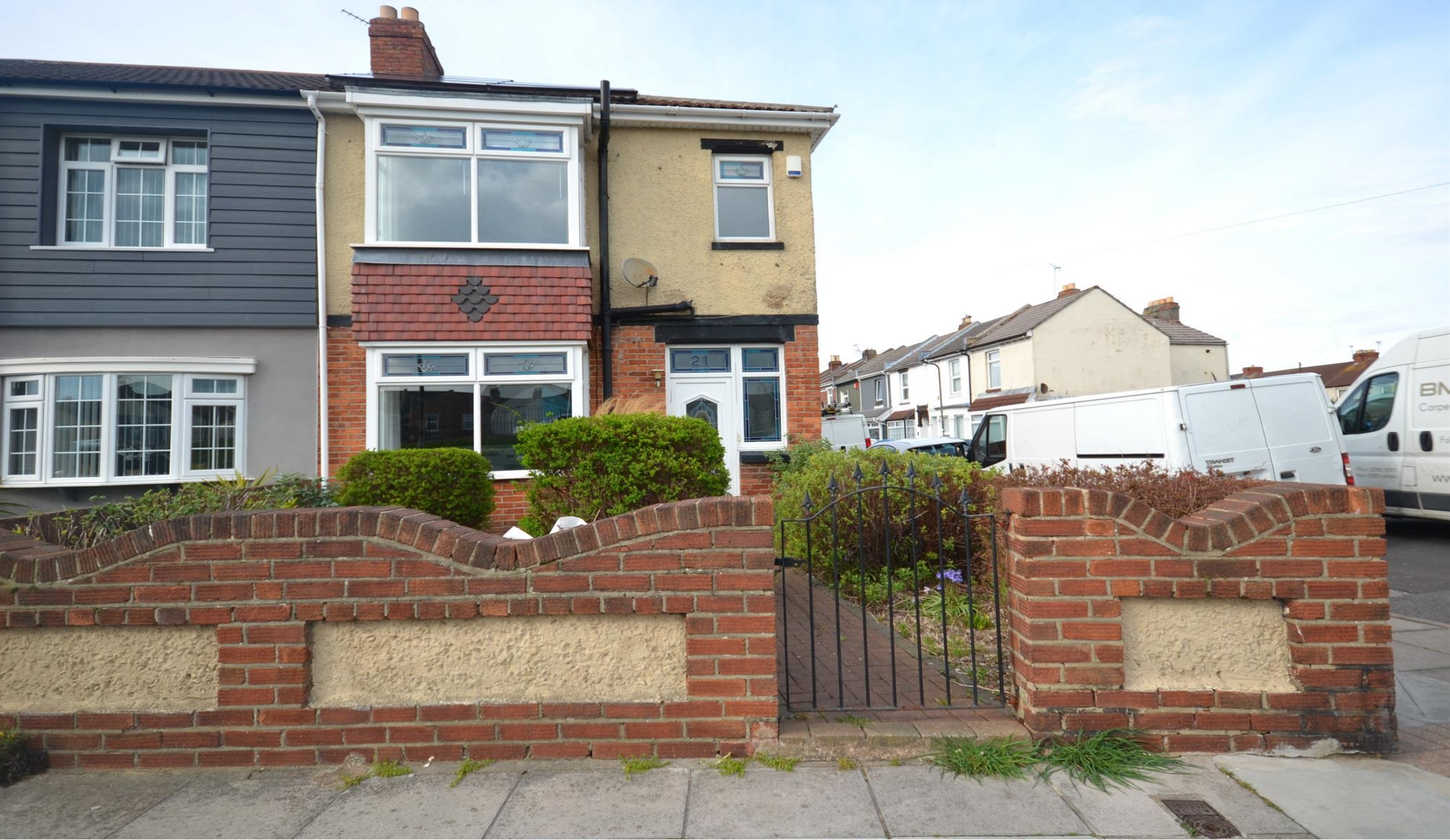
Burrfields Road, Portsmouth PO3 5DP