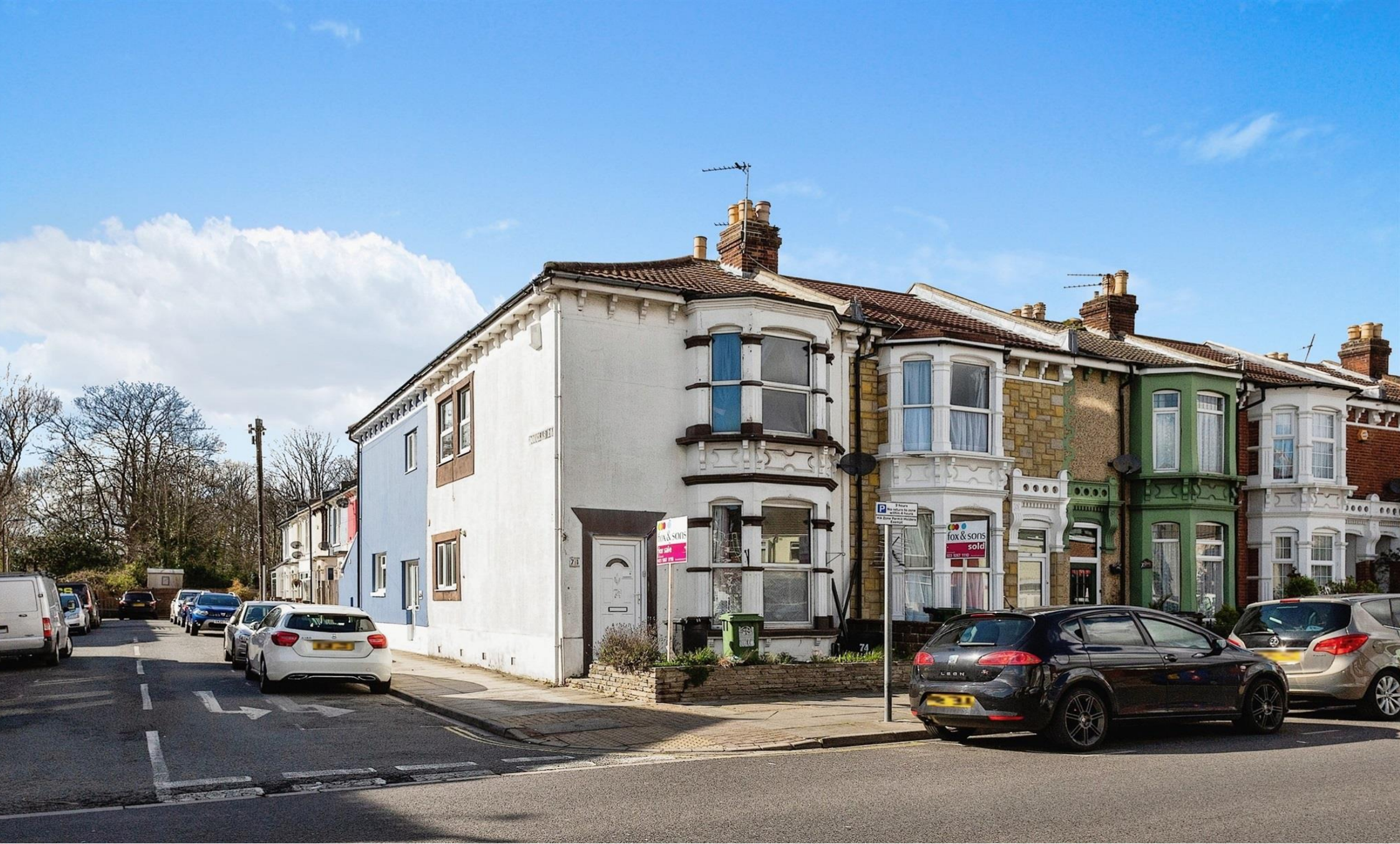
Milton Road, Portsmouth PO3 6AR