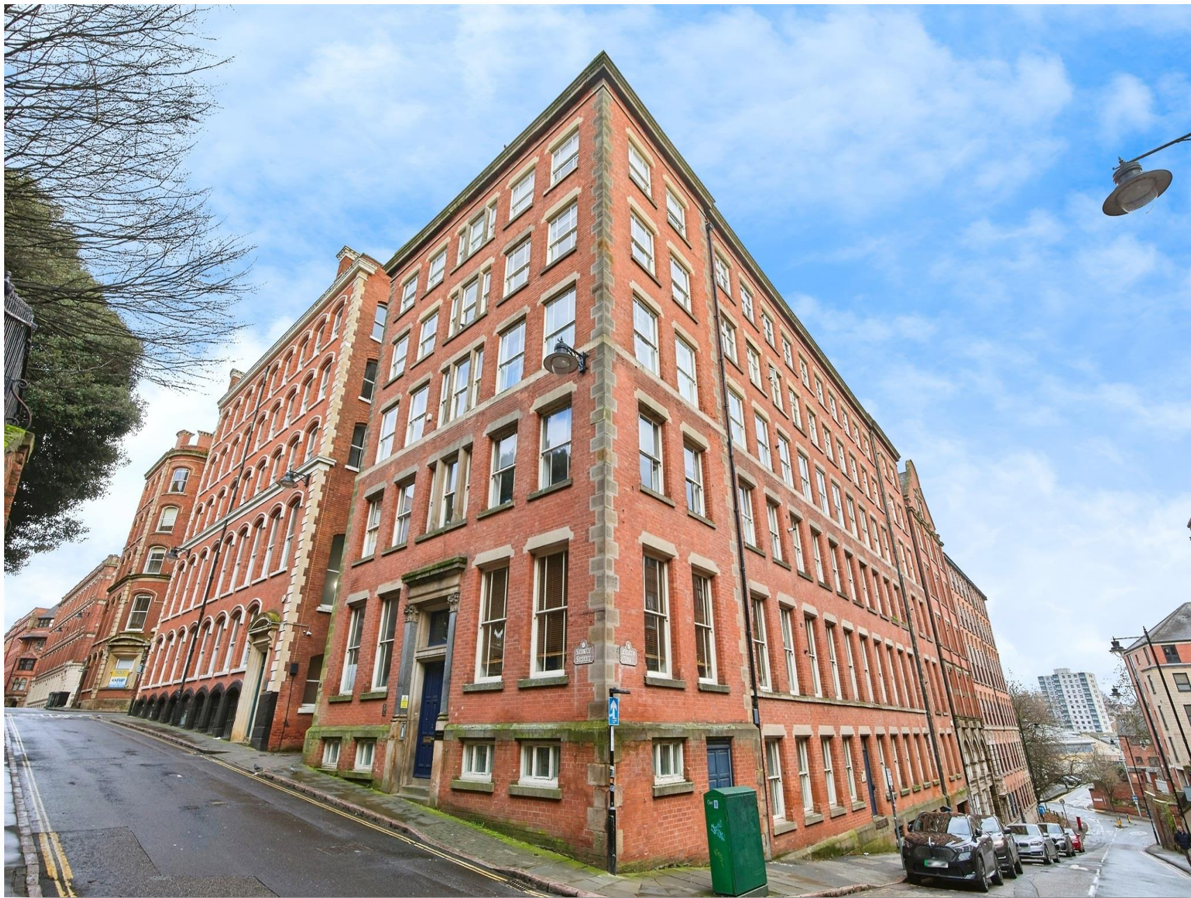
Stoney Street, Nottingham NG1 1QX