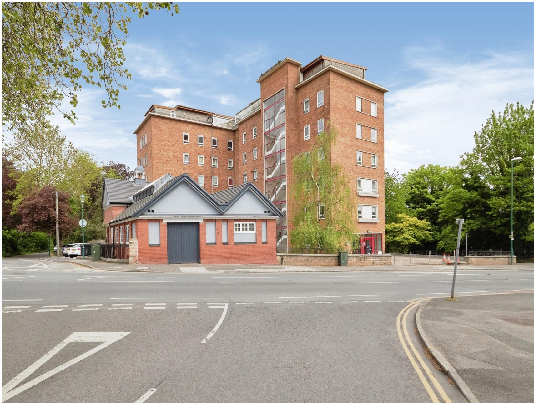
The New Alexandra Court Woodborough Road, Nottingham NG3 4LN