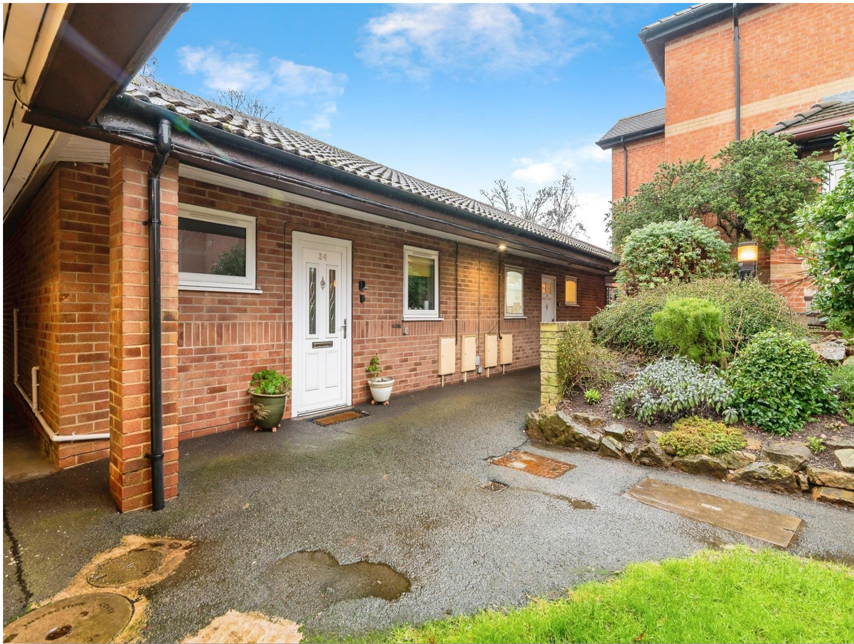
Birch Walk, The Firs Nottingham NG5 3BD