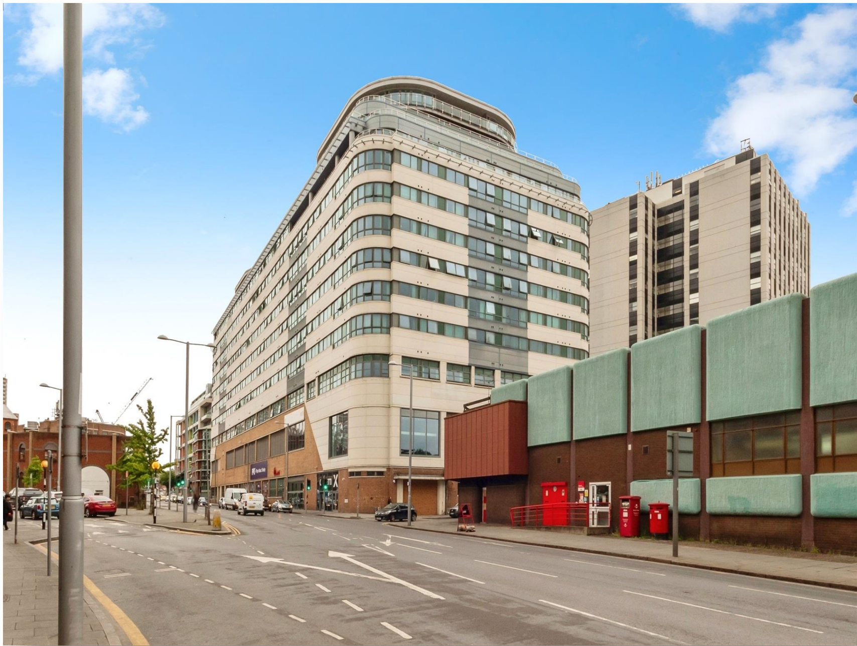
Marco Island Huntingdon Street, Nottingham NG1 1AW