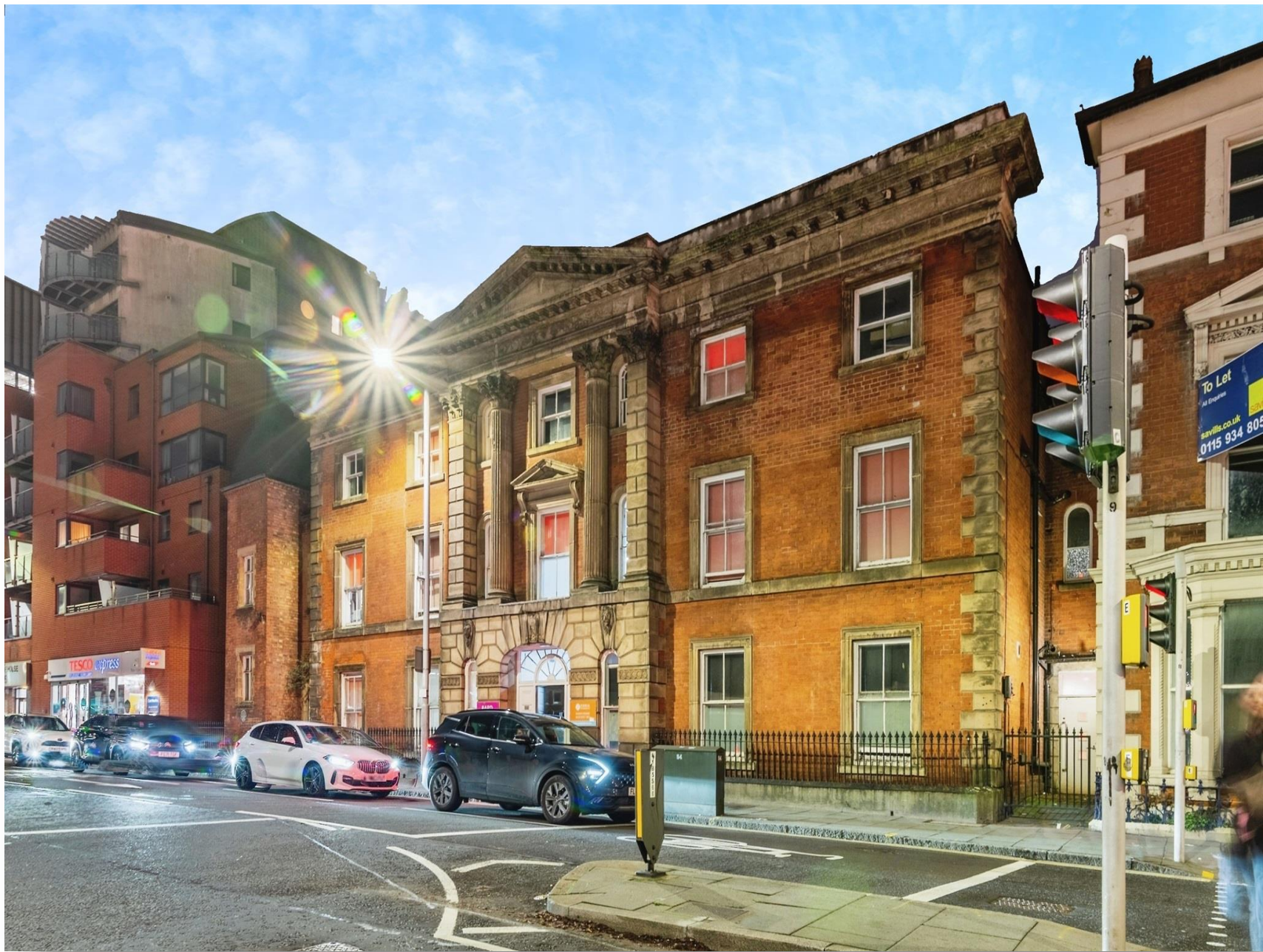
Bard House Shakespeare Street, Nottingham NG1 4AH