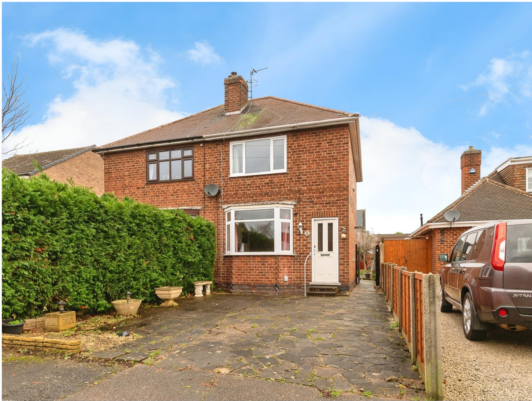
Rutland Avenue, Toton Nottingham NG9 6EP