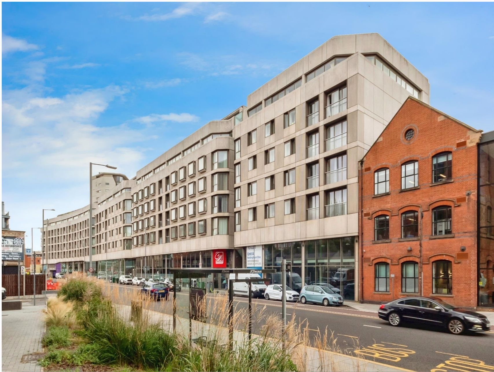
Nottingham One Canal Street, Nottingham NG1 7HT