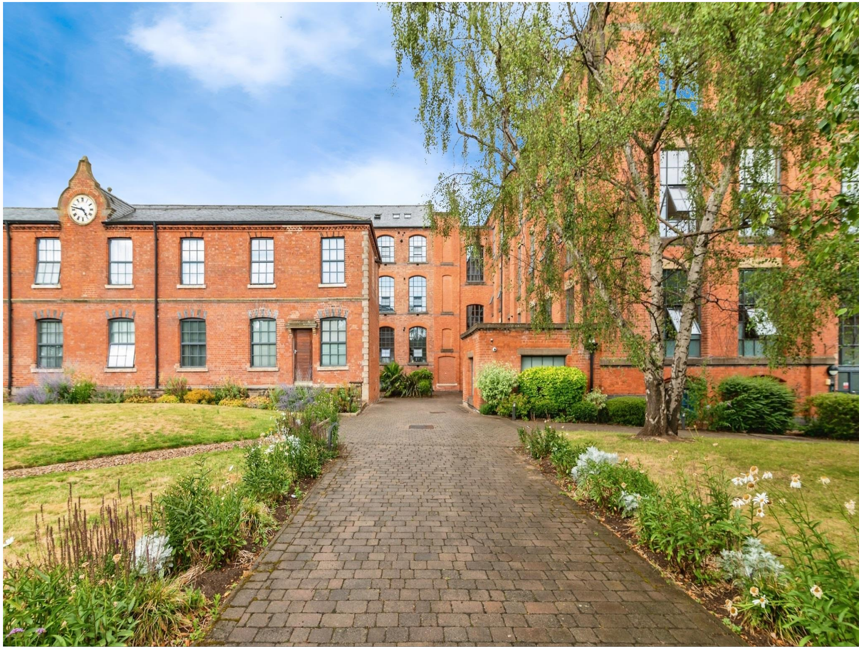
Morley Mills Morley Street,Daybrook Nottingham NG5 6JL