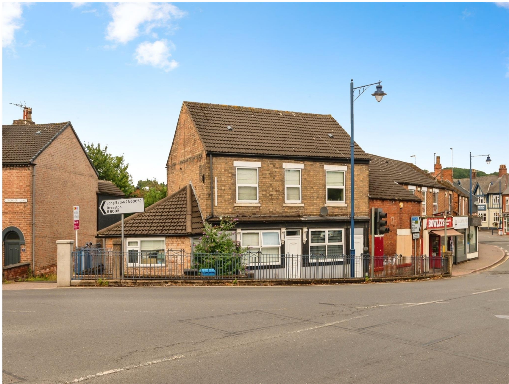
Derby Road, Sandiacre Nottingham NG10 5HS