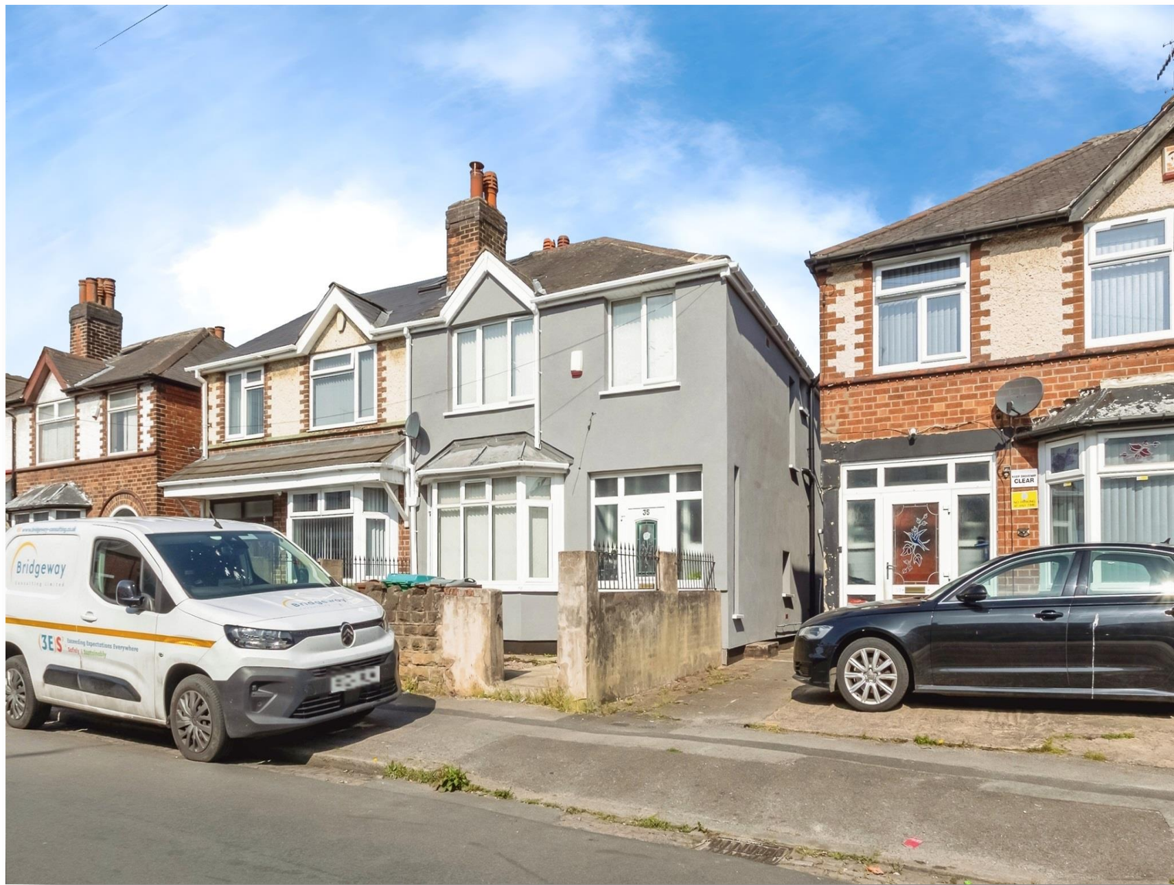
Chadwick Road, Nottingham NG7 5NN