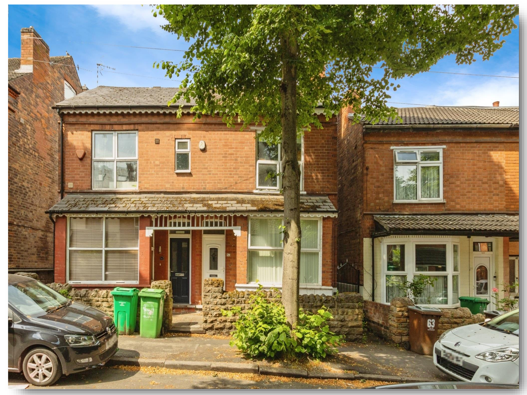
Derby Grove, Nottingham NG7 1PE