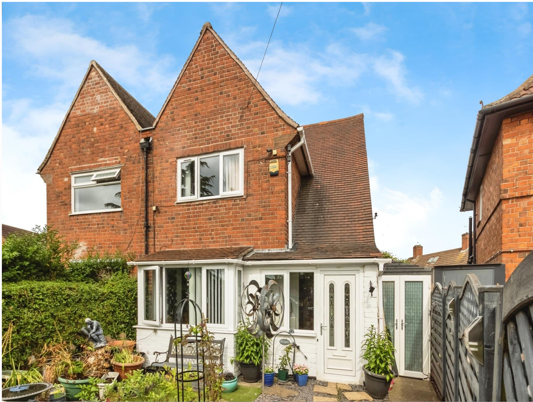
Findern Green, Nottingham NG3 7BU