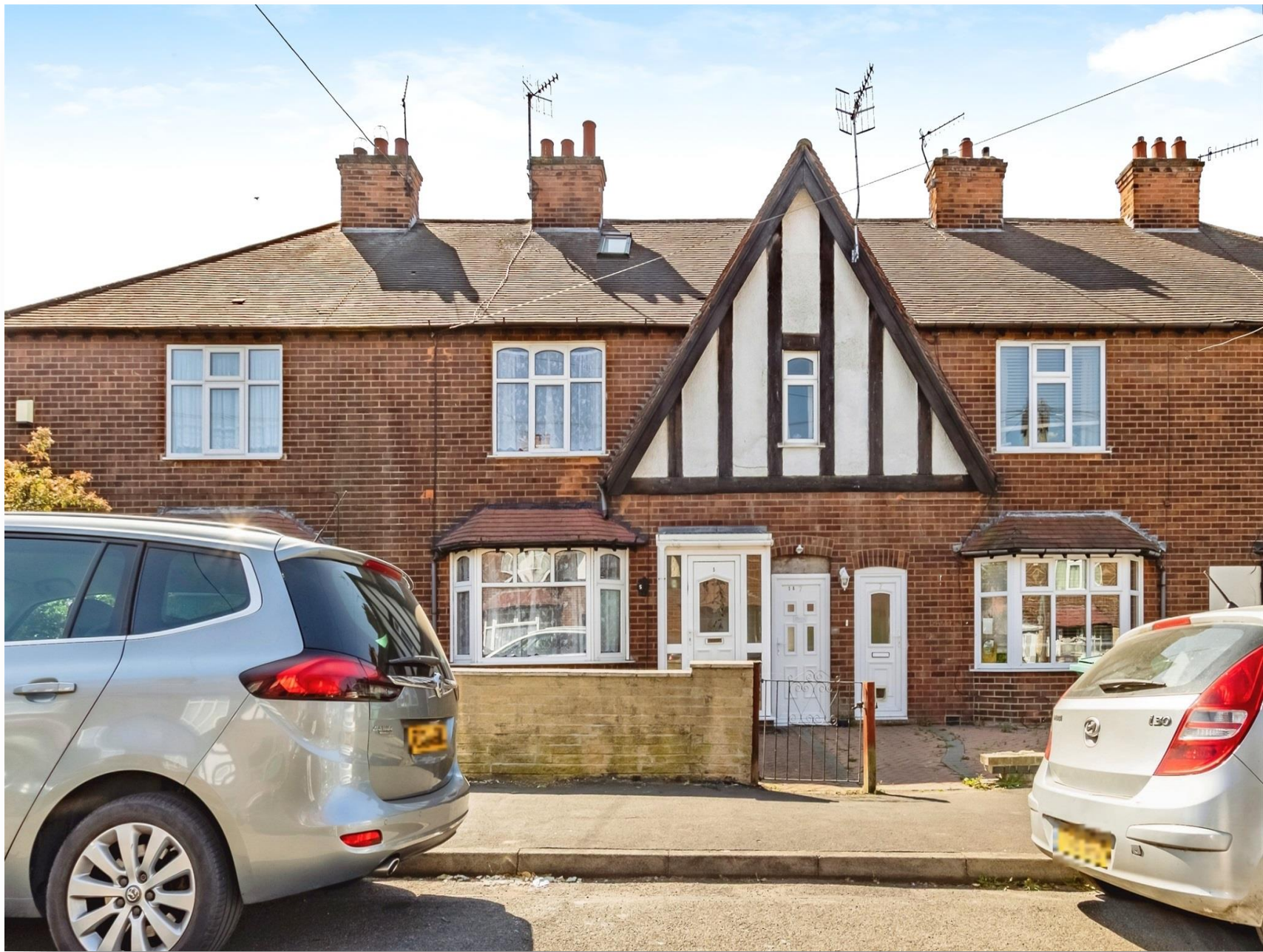
Woodstock Avenue, Nottingham NG7 5QP