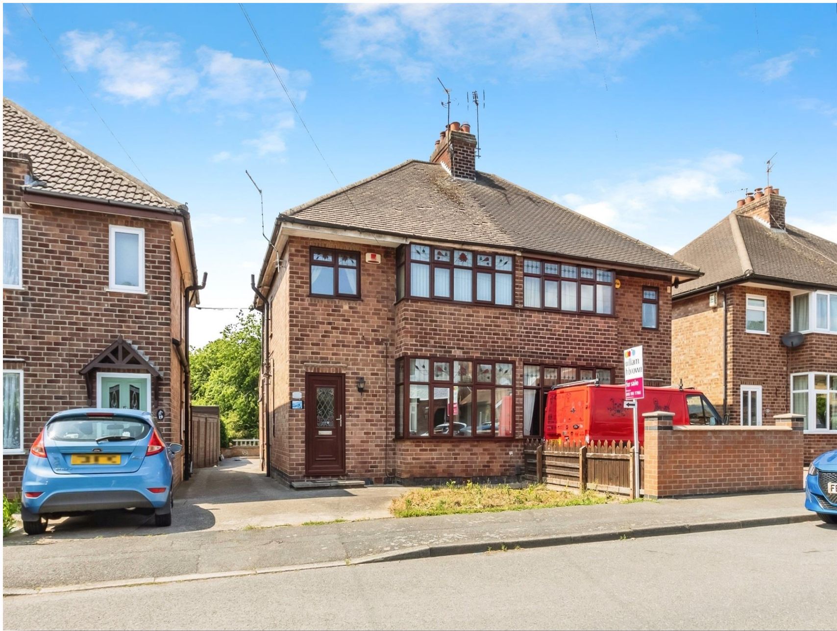
York Avenue, Sandiacre Nottingham NG10 5HA