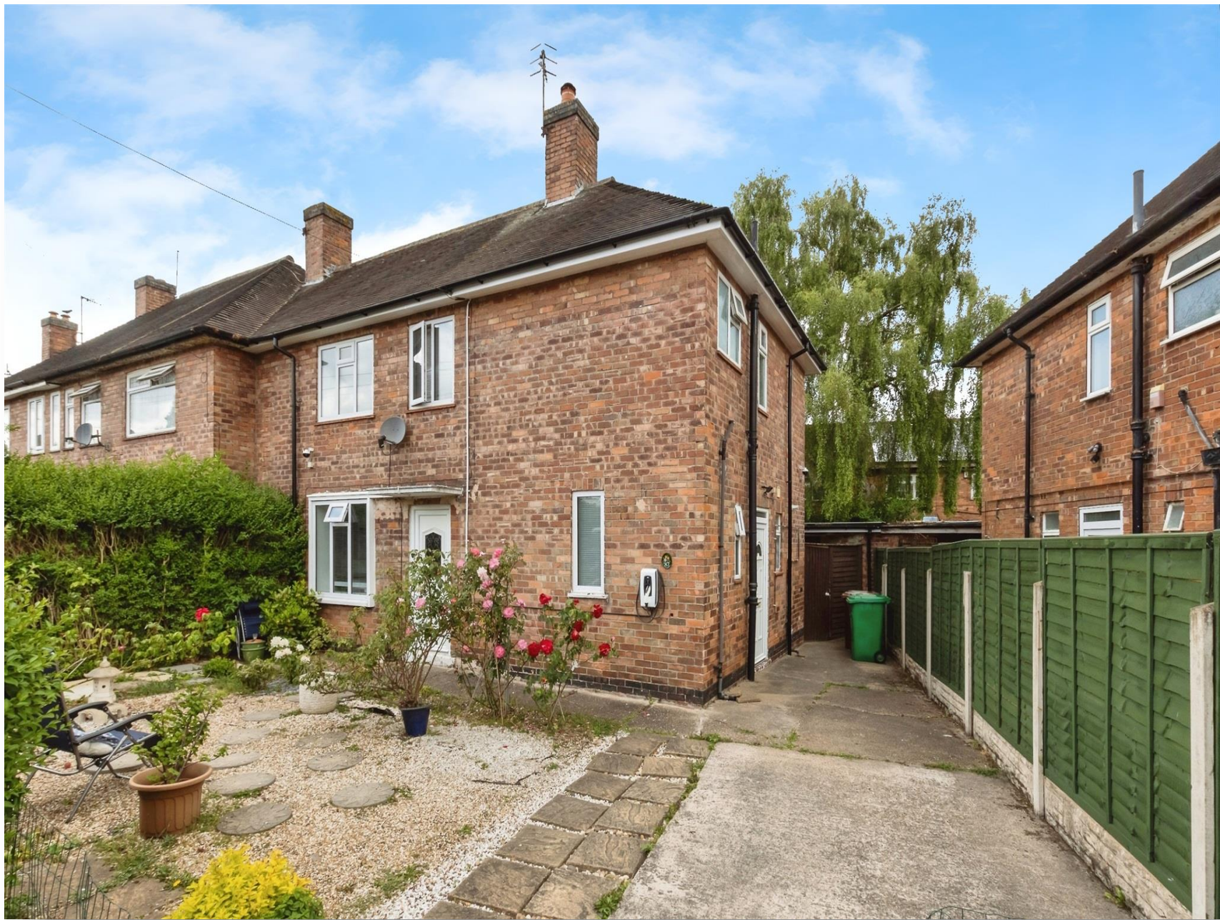
Southfield Road, Nottingham NG8 3PN