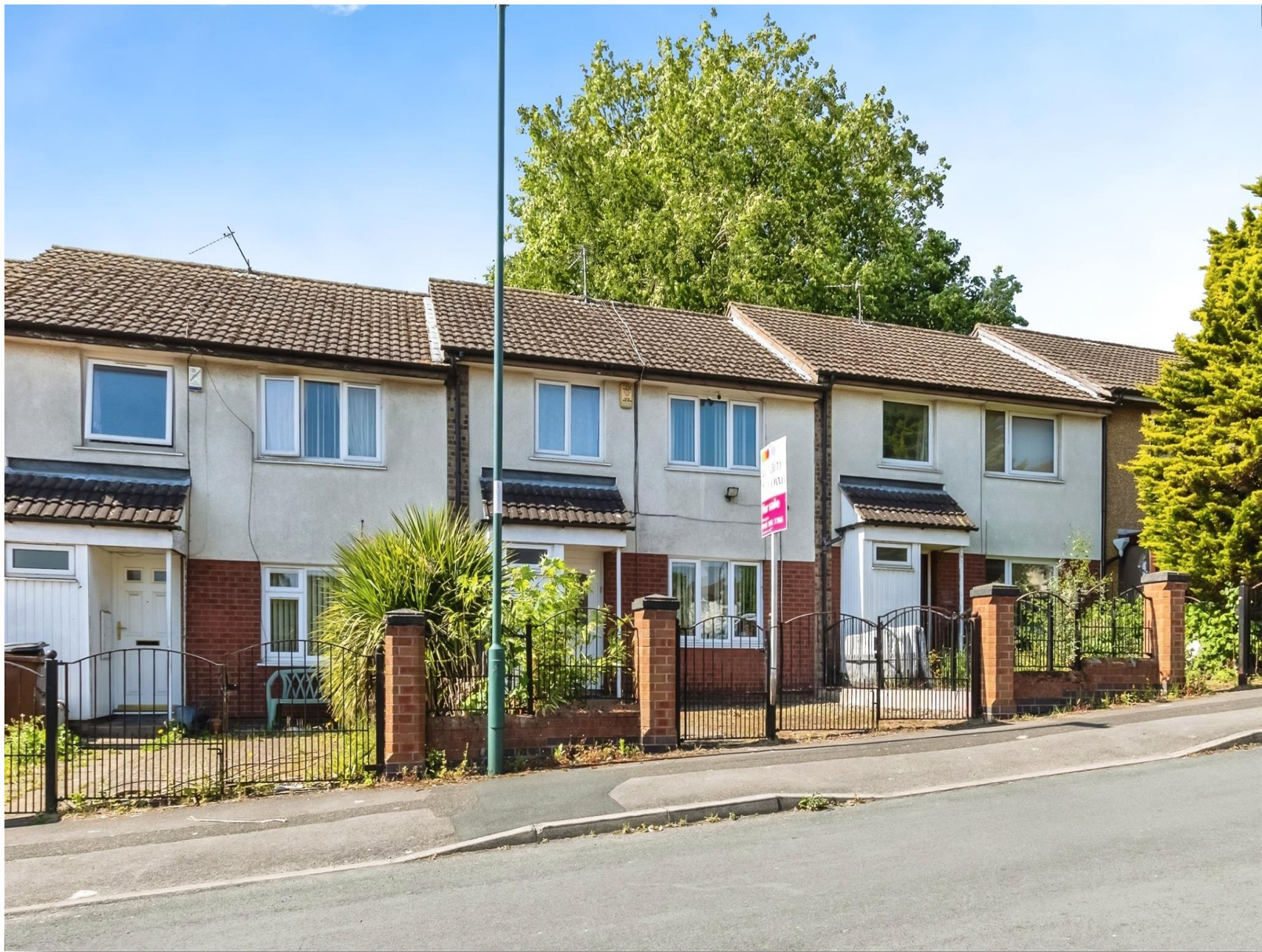
Verbena Close, NOTTINGHAM NG3 4PZ