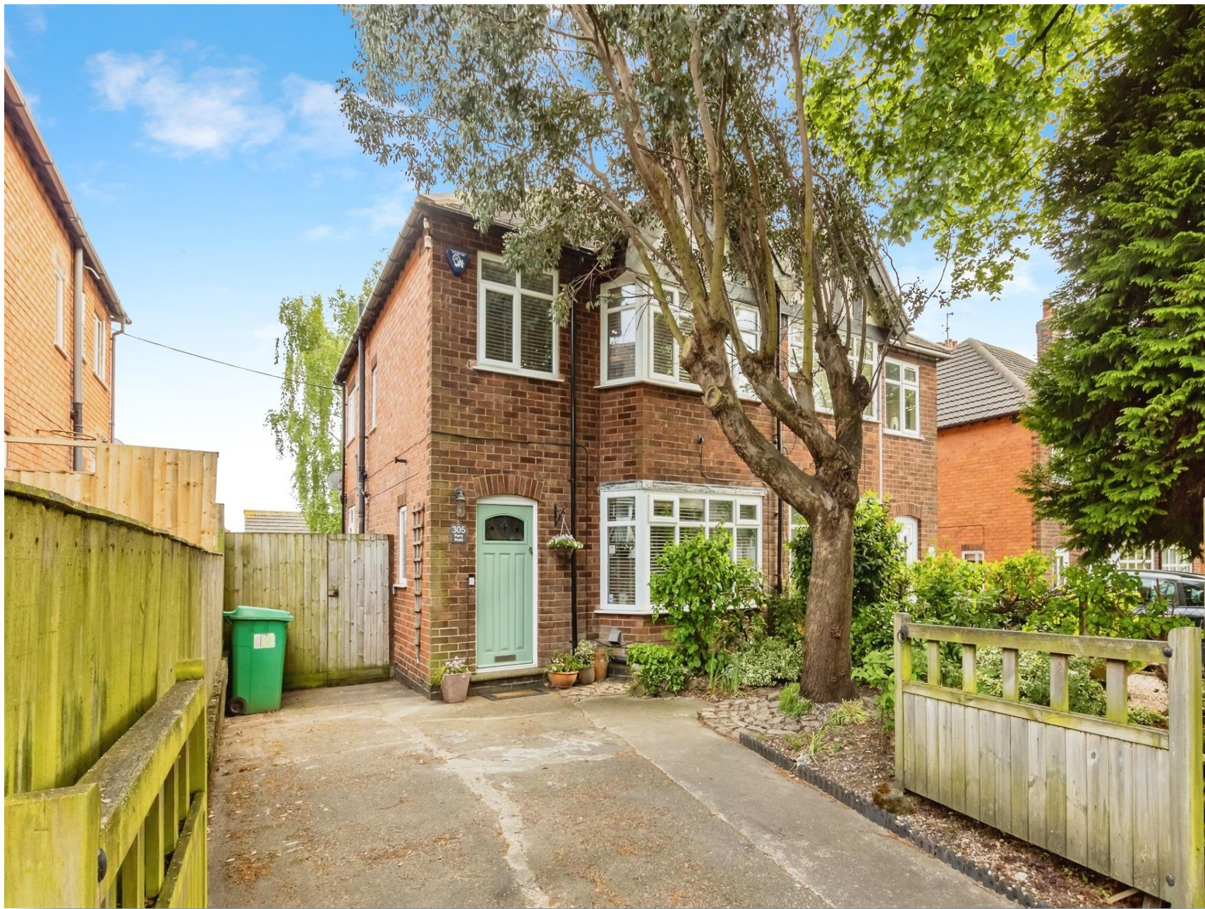
Perry Road, Nottingham NG5 1GQ