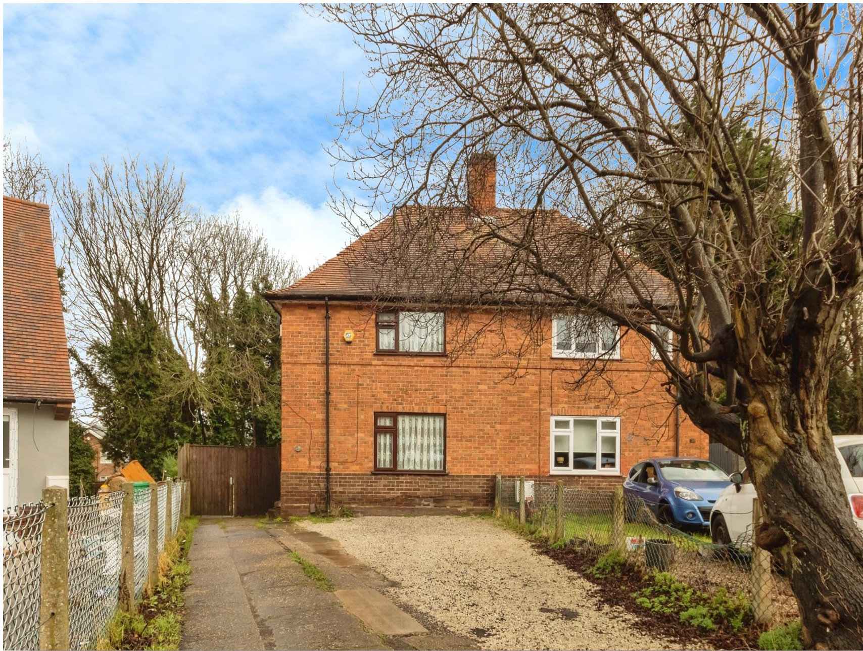
Halstead Close, Nottingham NG8 6ER