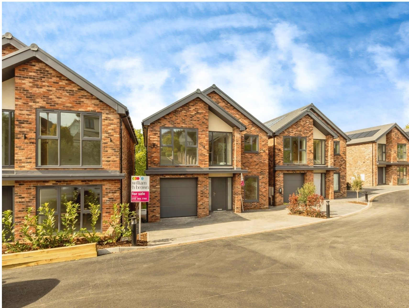
Gardenia View Gardenia Grove, Nottingham NG3 6HY