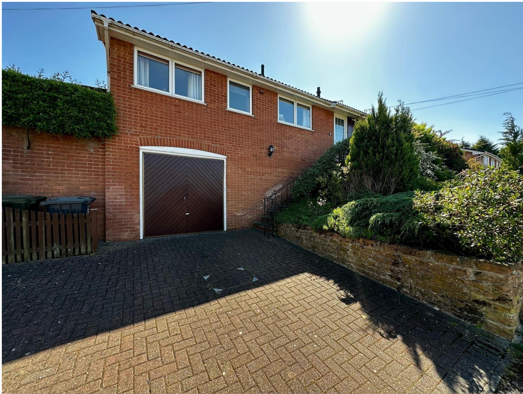
Russet Avenue, Carlton Nottingham NG4 3BT