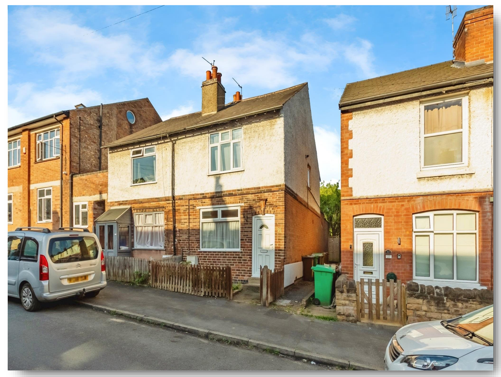
Crossley Street, Nottingham NG5 2LF