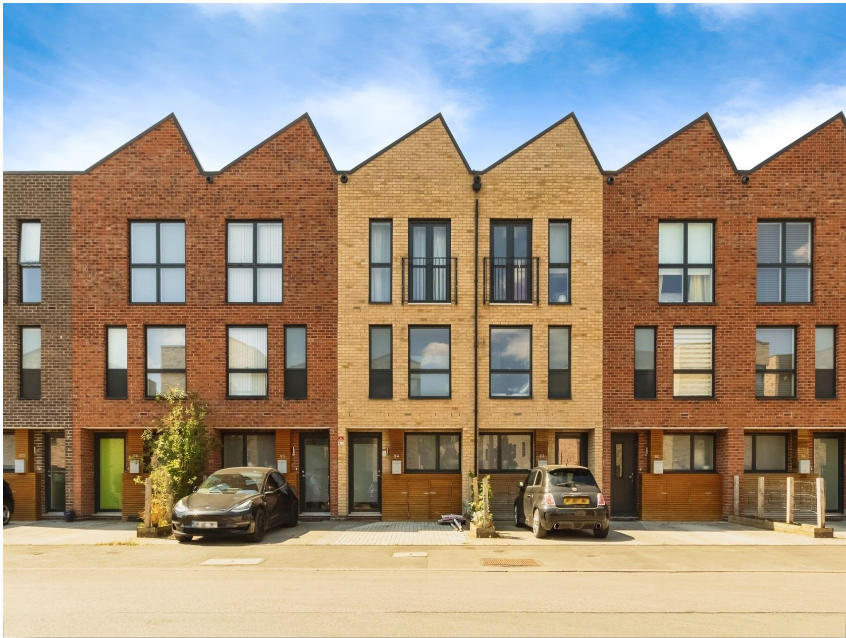
Trent Lane, Nottingham NG2 4DL