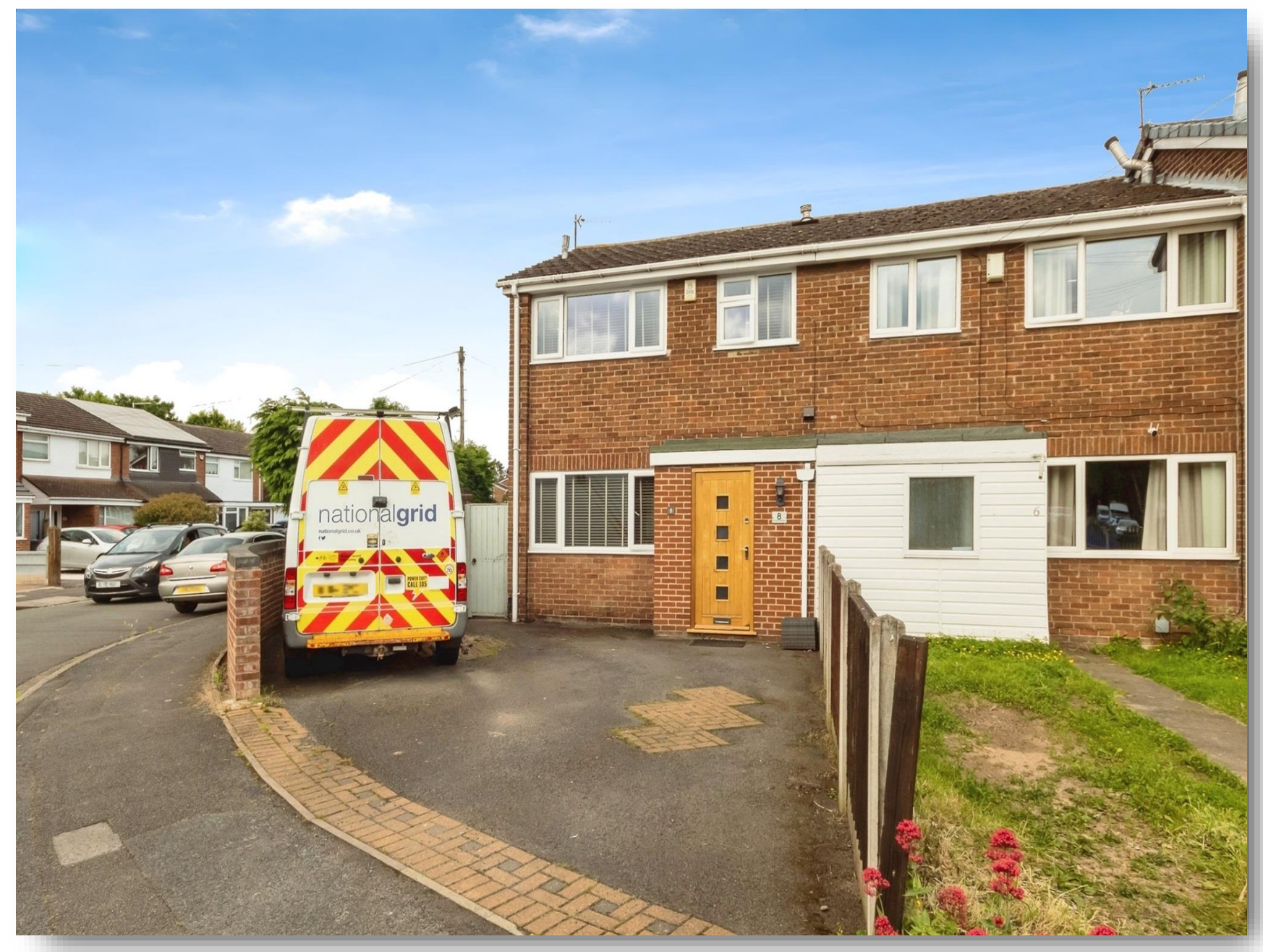
Valeside Gardens, Colwick Nottingham NG4 2EP