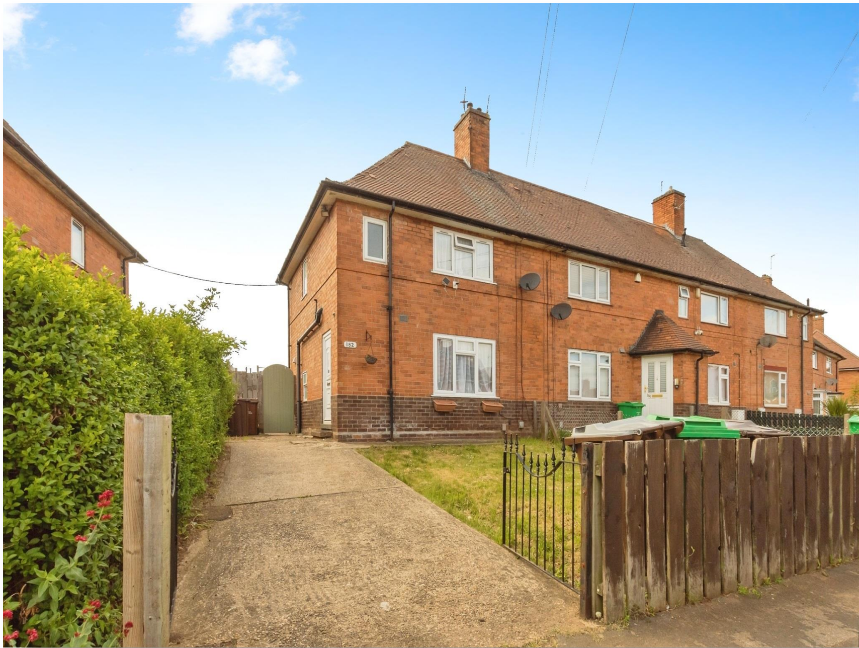
Amesbury Circus, Nottingham NG8 6DD