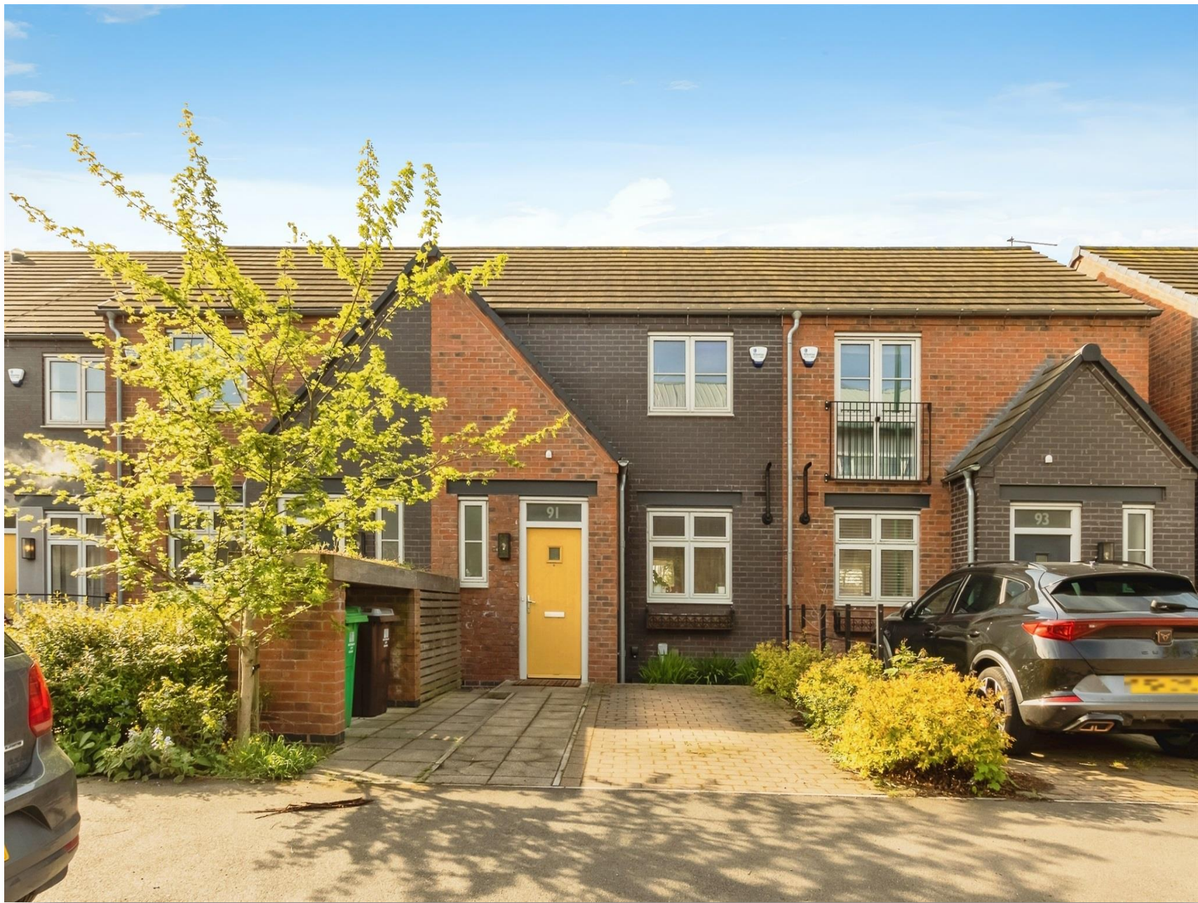
Perry Road, NOTTINGHAM NG5 3AD