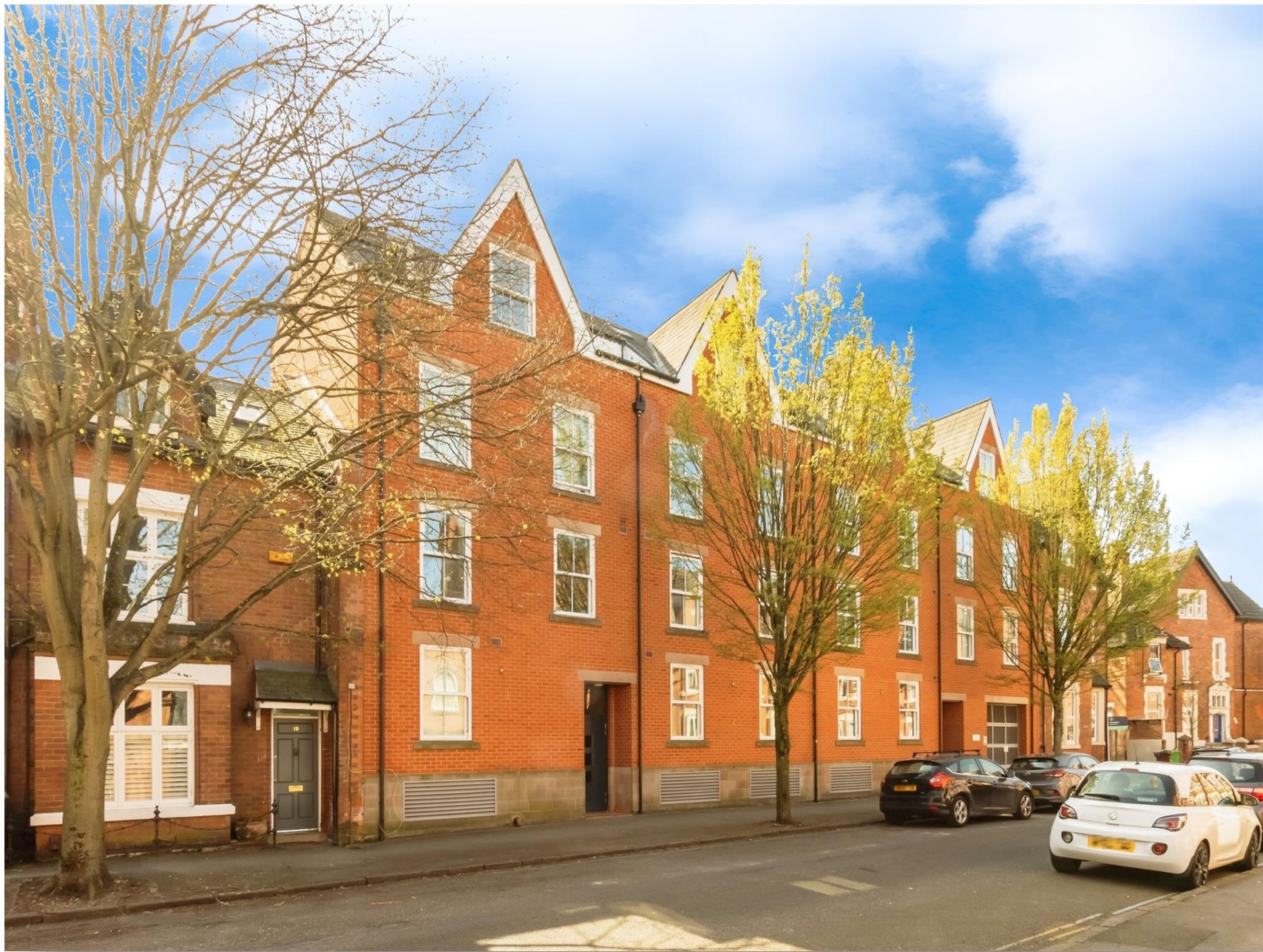
The Gallery Hope Drive, Nottingham NG7 1BT