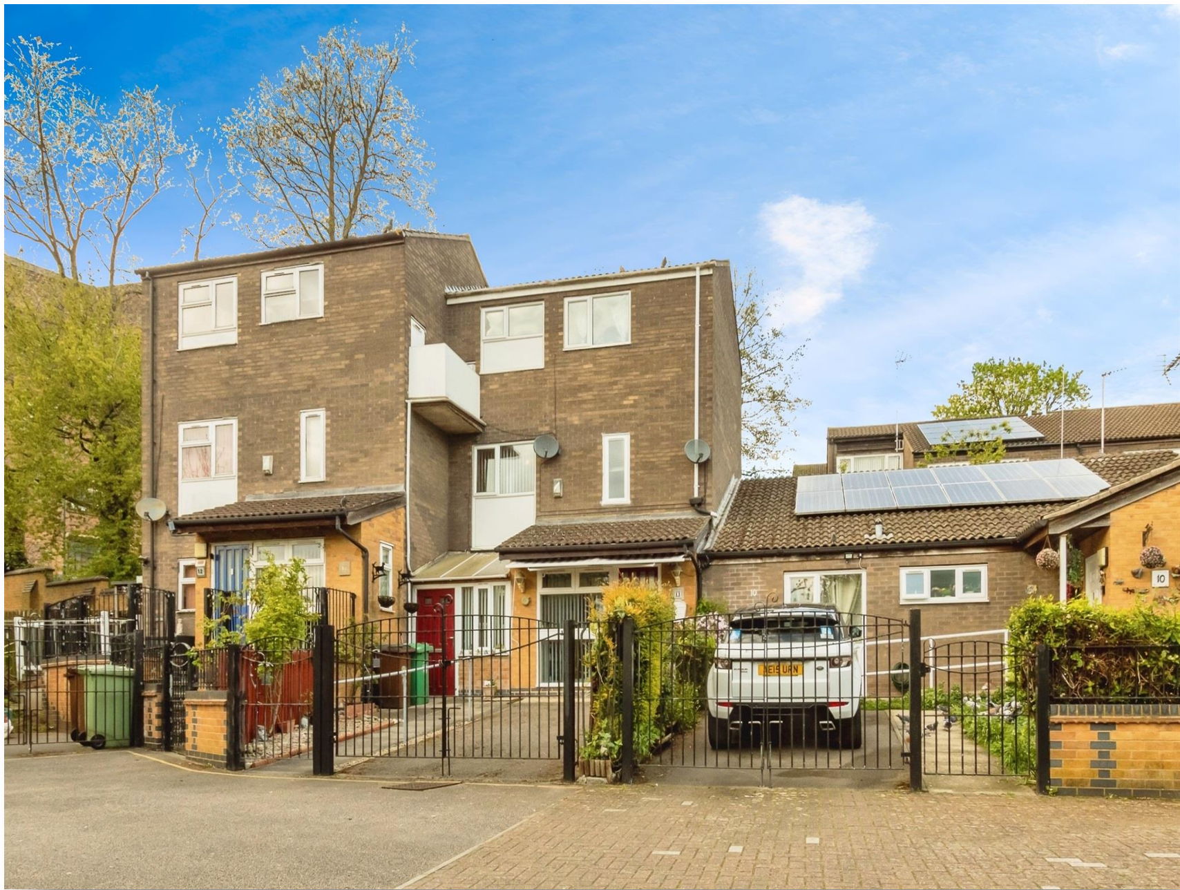
Bangor Walk, Nottingham NG3 4FS