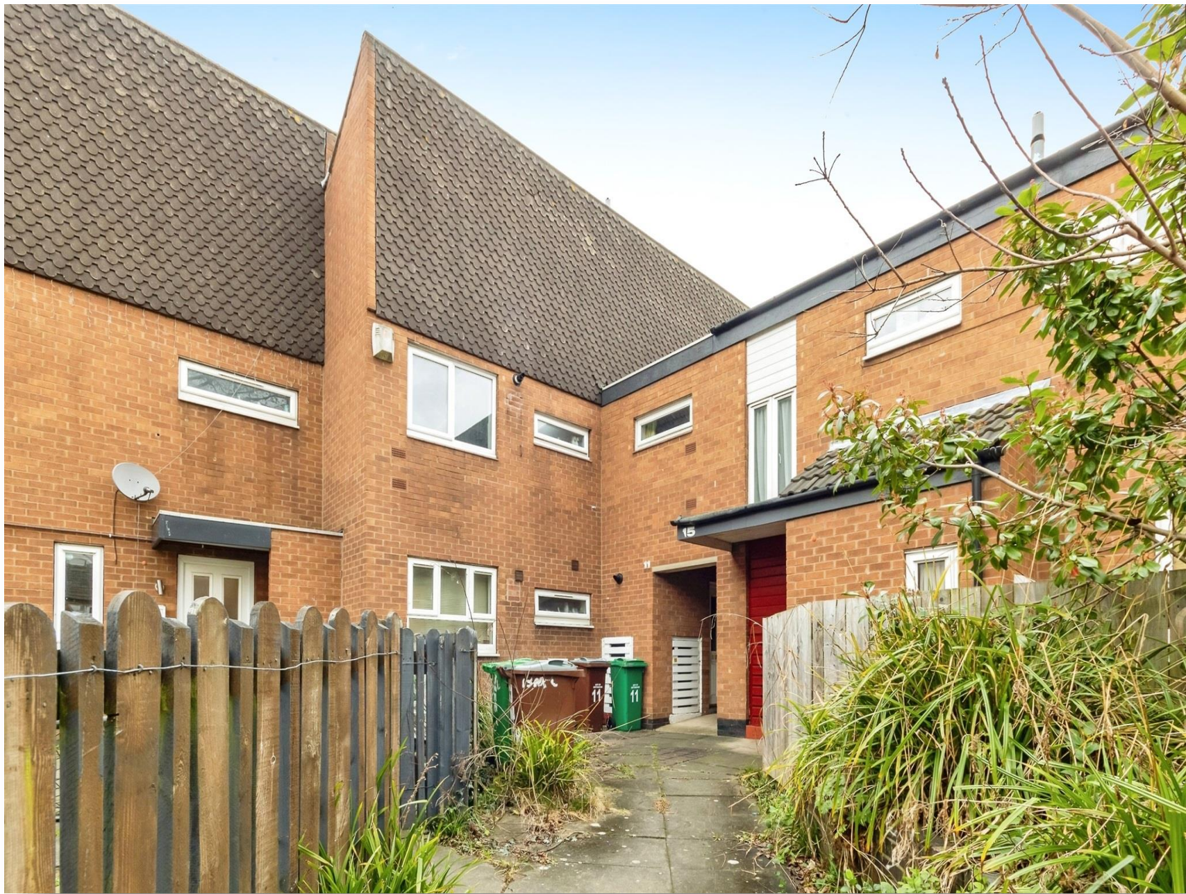
Meredith Close, Nottingham NG2 1PH