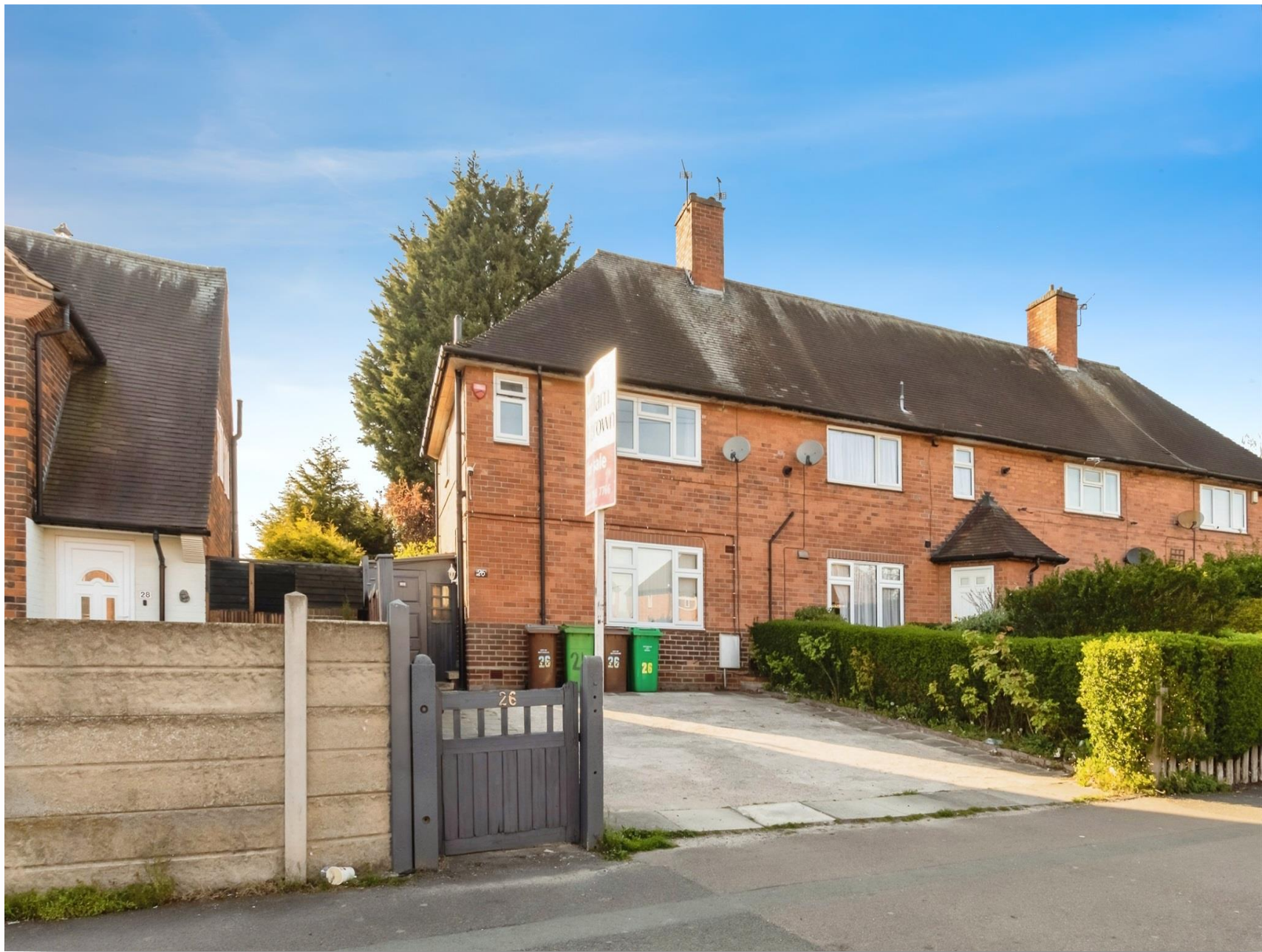
Beechdale Road, Nottingham NG8 3AJ