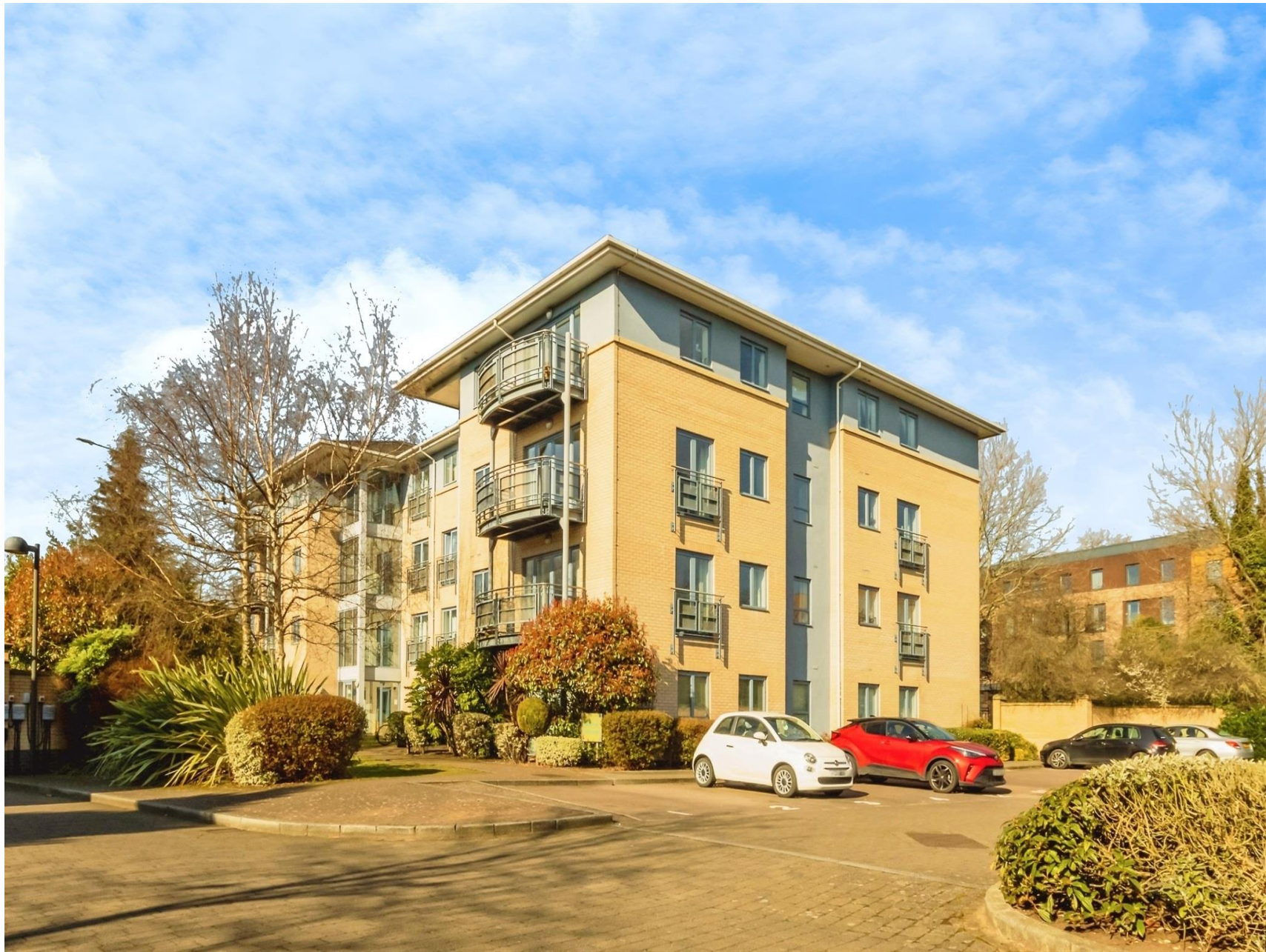
Marine House The Quays, Castle Quay Close Nottingham NG7