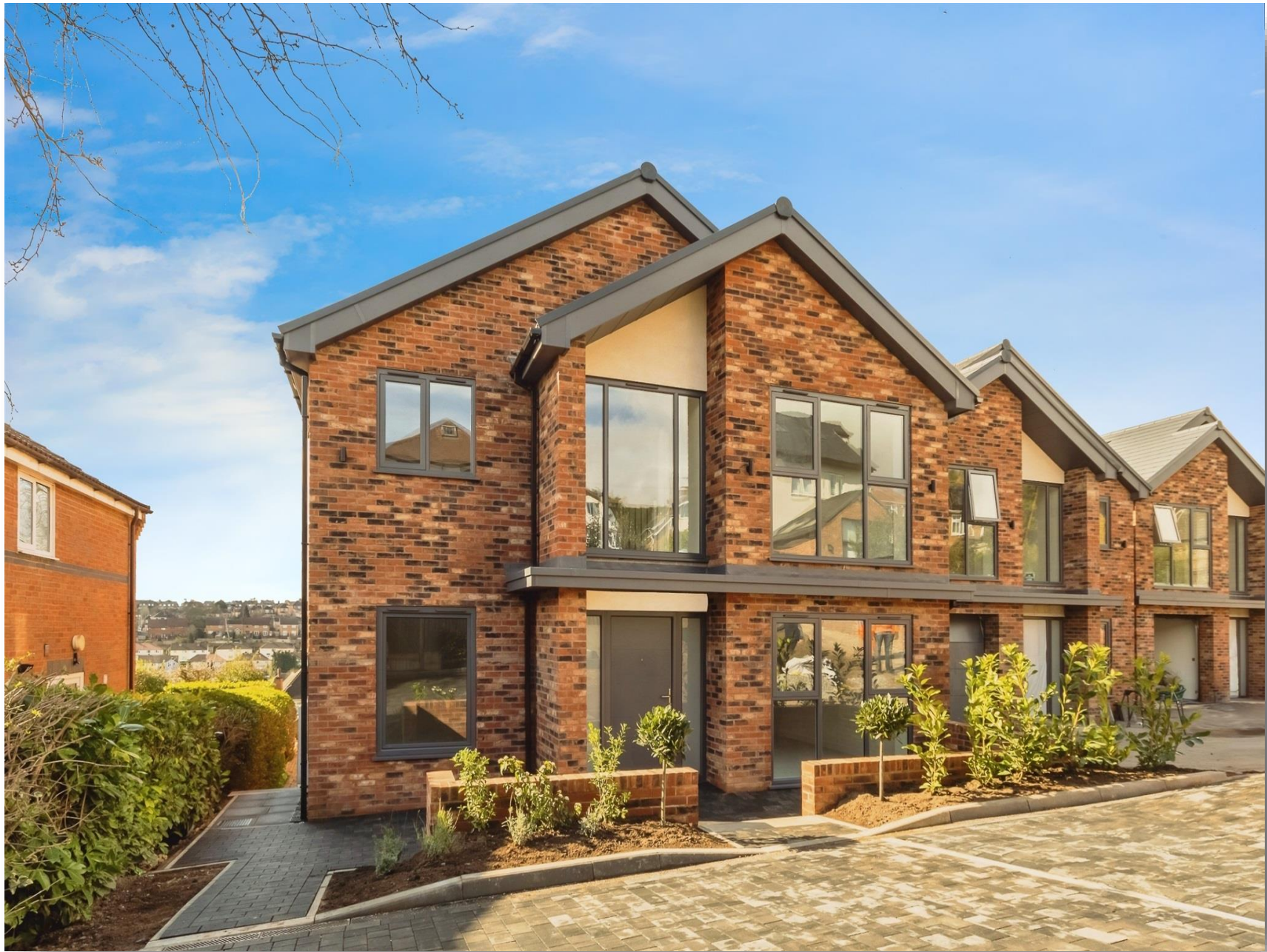
Gardenia Grove, Nottingham NG3 6HY