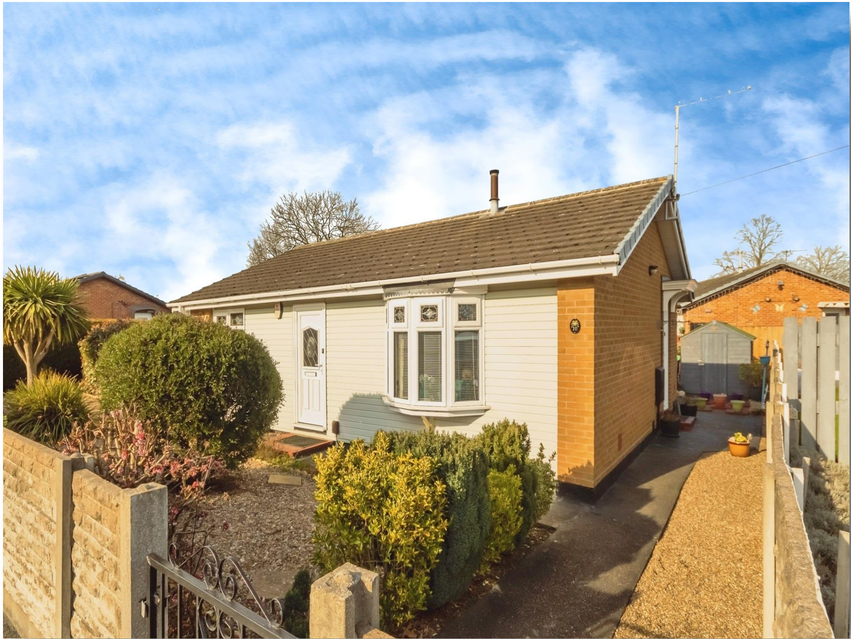
Wigman Road, Nottingham NG8 3HW