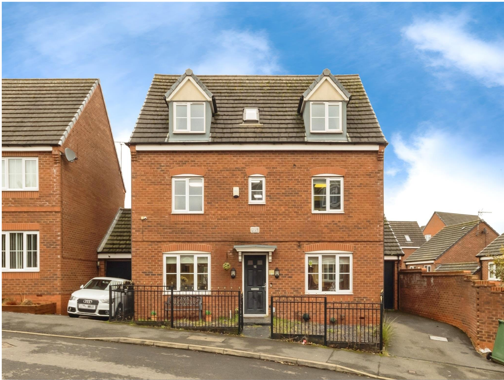
Bailey Drive, Nottingham NG3 5US