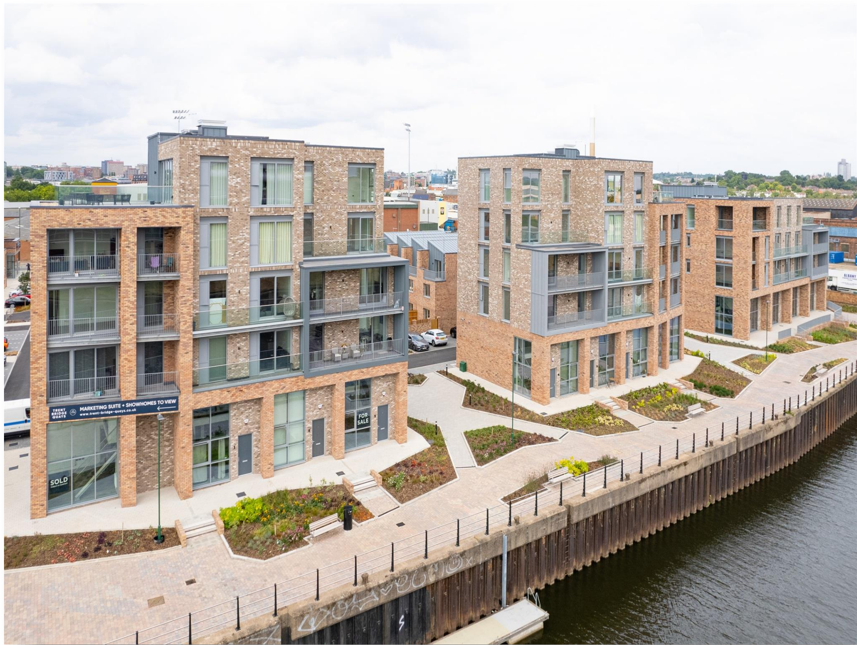
Trent Bridge Quays Trent Bridge View, Nottingham NG2 3EY