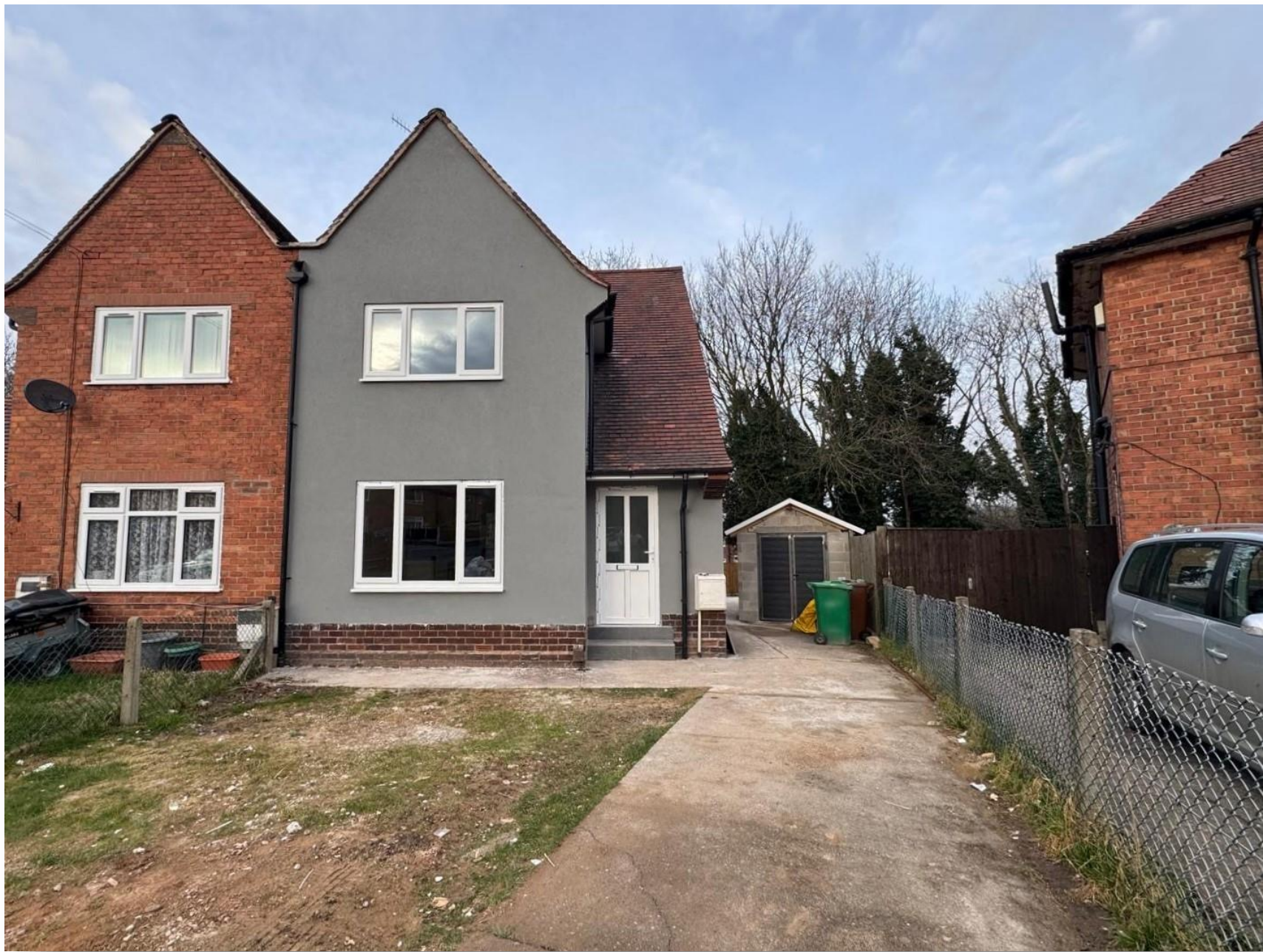
Halstead Close, Nottingham NG8 6ER